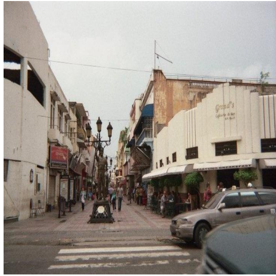
My first introduction to El Conde. A major street in Santo Domingo.