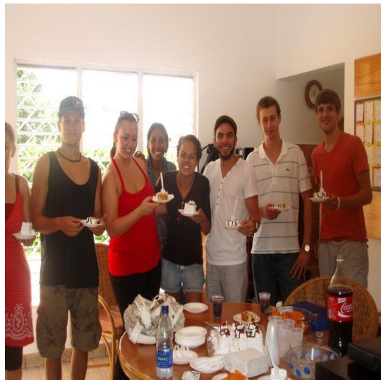
Celebrating multiple birthdays in Santo Domingo.