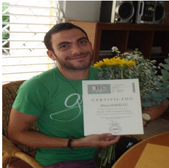
Graduating from the school and receiving my diploma.