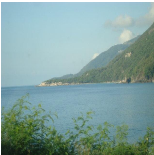
A view on the way to the country.