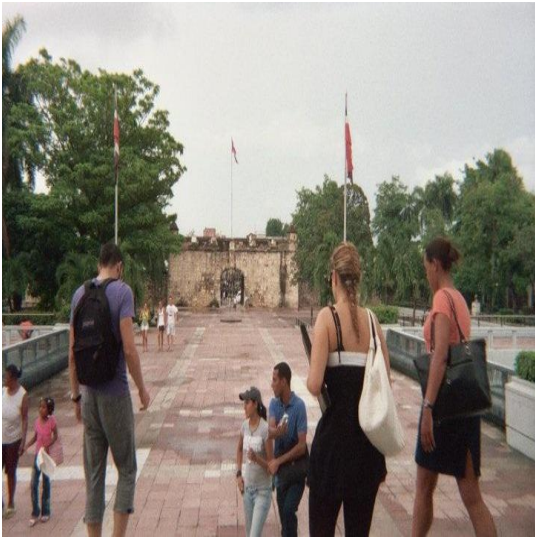
La Parque Independencia. A National Monument to the founding fathers of DR.