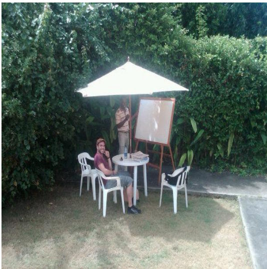
Outside class on a rare sunny day. It rained for two weeks.