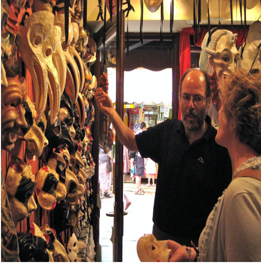
Learning the meanings of Venetian masks from the artist himself