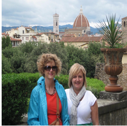
Exploring the Boboli Gardens overlooking Florence.