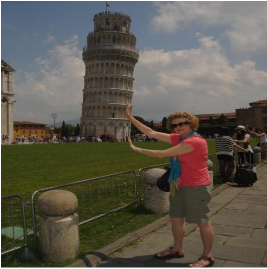
Leaning Tower in Pisa. (It's a cliché, but you just gotta' do it!)