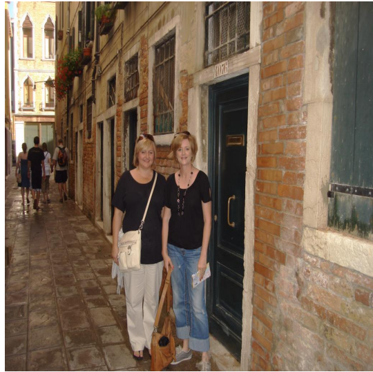
Taking in the architecture of Venice.