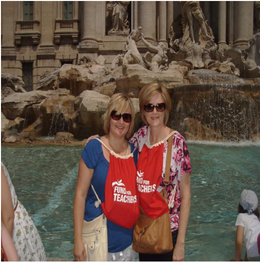
Teachers at the Trevi Fountain in Rome.