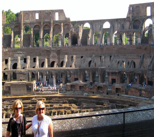
Standing in the wonder of the Colosseum in Rome.