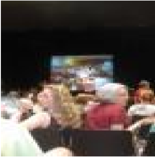
listening to keynote speakers