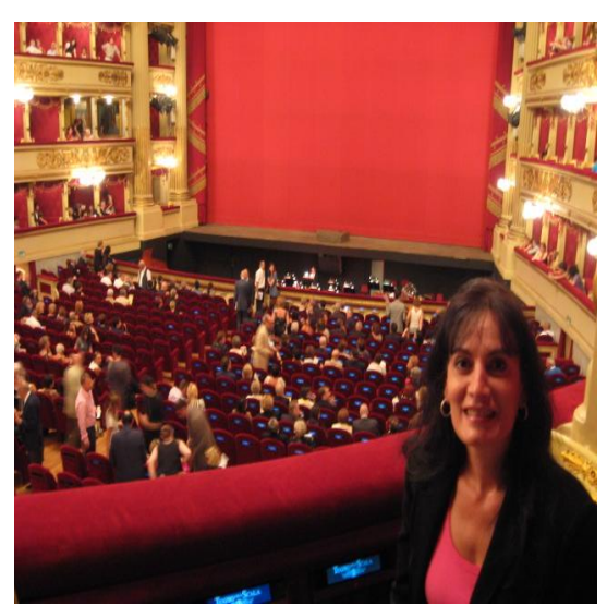
In La Scala Milan at a performance of The Barber of Seville