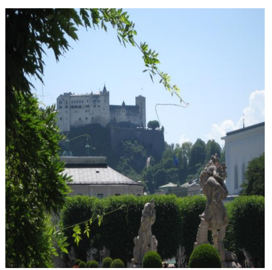
Salzburg: city of Mozart