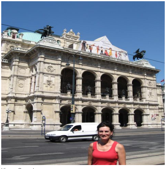
Vienna Opera house