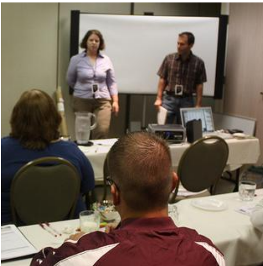
The screenwriters talking about the process and timeframe of writing the story.