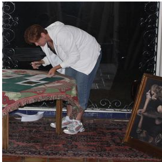
Here I am working on the set design at 2 am!