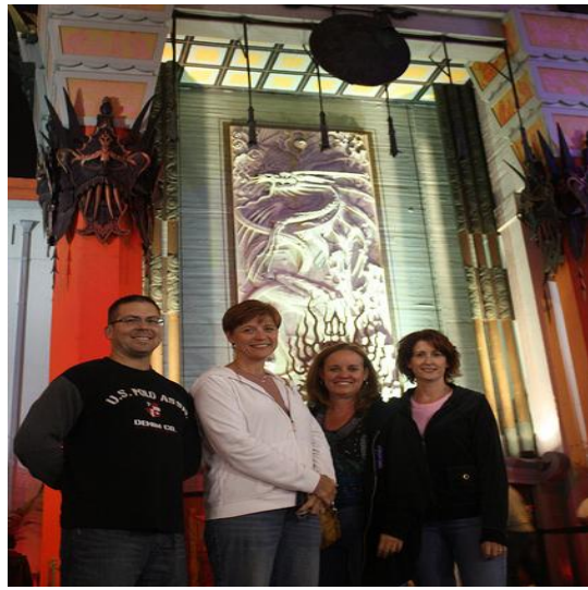
At Grauman's Chinese Theatre on our last night, exhausted from lack of sleep!