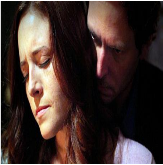
The actors during the climax shot of the film