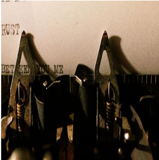
Still shot from the film, which is about a journalist and an art thief.