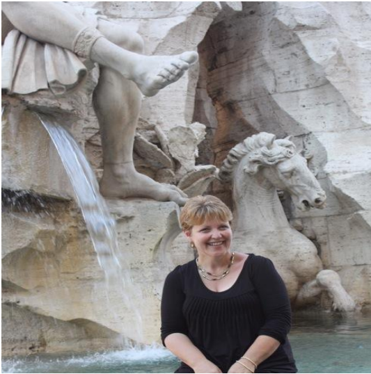
One of the many fountains of Rome