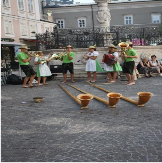
Swiss Alpine horns performing for us - what beautiful, soulful music