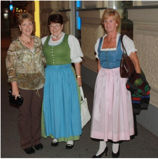
Vintage clothing of Heidelberg, Germany