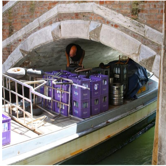
Can't wait to show students how supplies are taken to Venecian business owners