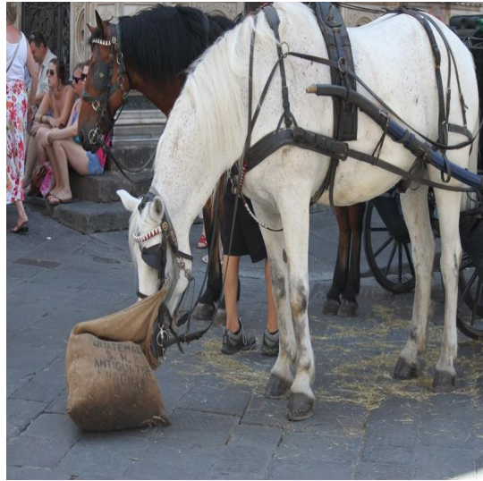
A serene historic moment in Florence