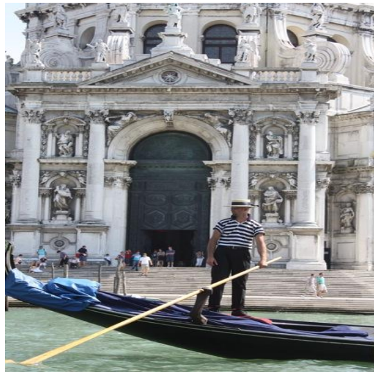
Venice, Italy, its architecture & water transportation