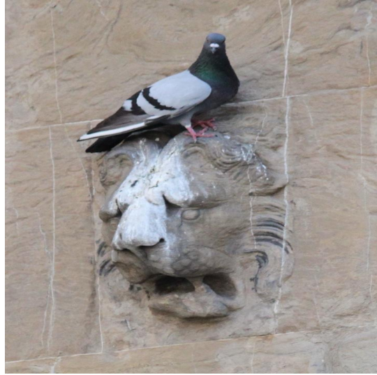
One of Europe's obvious problems...