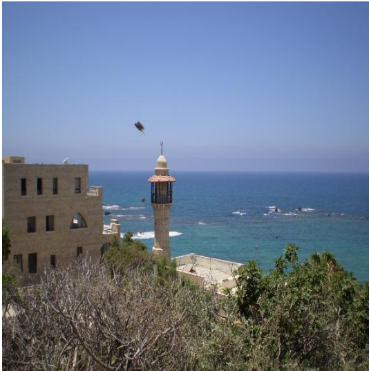
The ancient and beautiful port city of Jaffa.