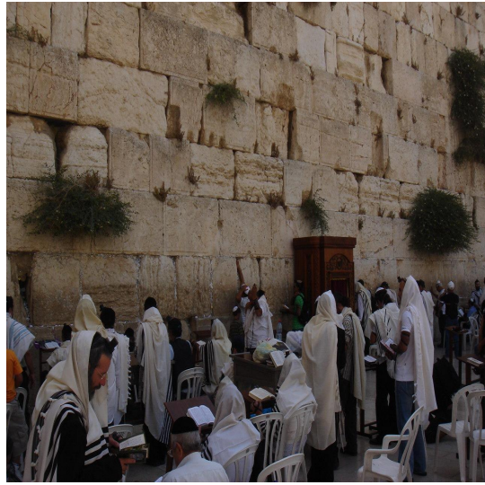
The Western Wall of the Temple Mount continues to be a place of worship for the Jewish people.