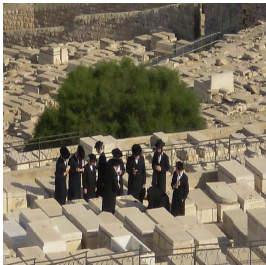
Ultra-Orthodox Jews visit one of the 140,000 graves outside the Temple Mount.