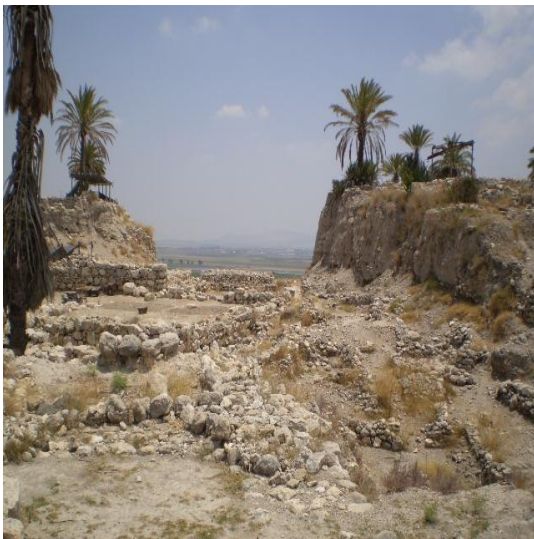
Archaeological remains at Tel Megiddo and the valley of Armageddon beyond.