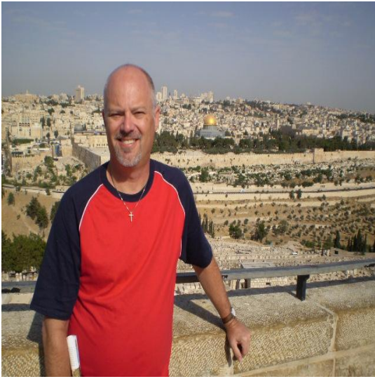
I am enjoying the early morning sun with the Dome of the Rock and Temple Mount to my back.