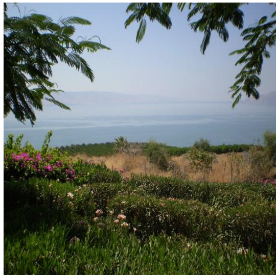
The Sea of Galilee from the site of the Mt. of Beatitudes.