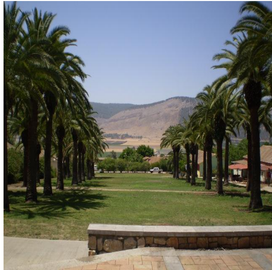
The kibbutz Ein Harod Meuhad in the lower Galilee.