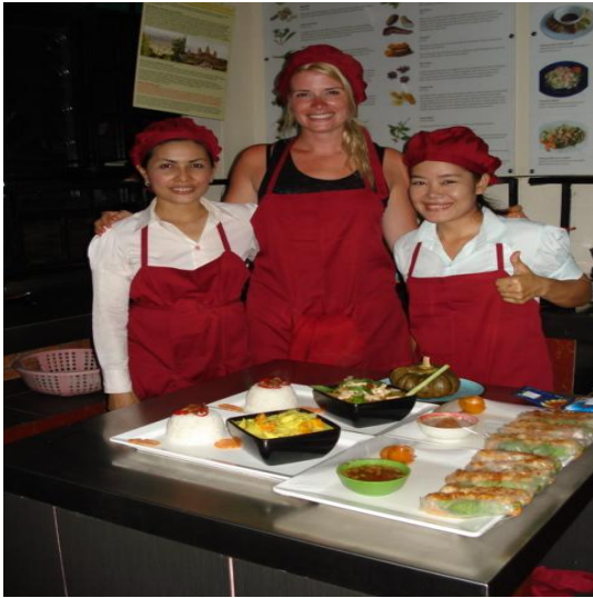
What's cookin', ladies?