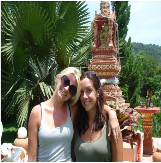
Thai Team in Action!