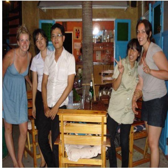
Taking a study break in Chiang Mai!