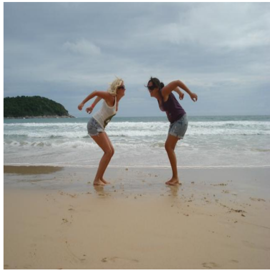
Permission to Launch: Thai Team!