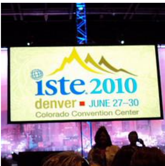
The opening screen.