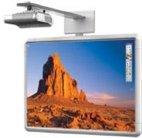
The Interactive White Board!