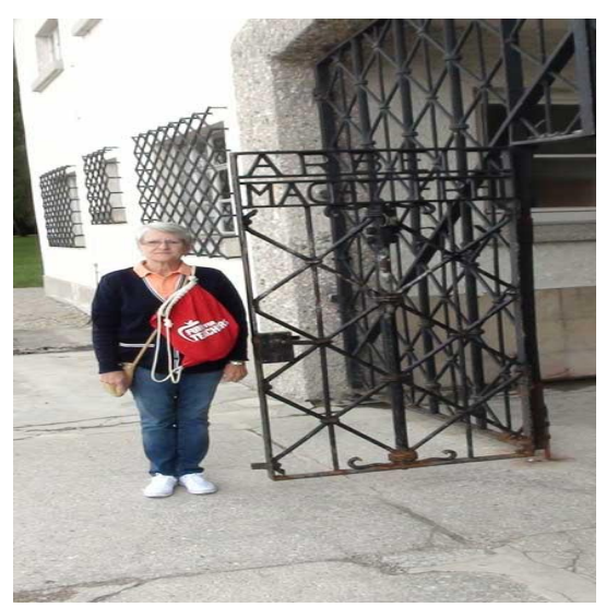
"Work Will Make You Free" on this gate, gave false hope to prisoners.