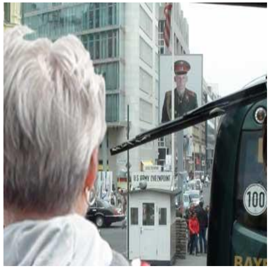
Checkpoint Charlie, where many tried to escape, was entrance to East Zone.