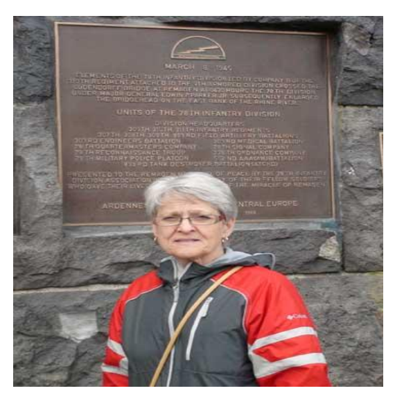
The Ludendorff Bridge was the last standing bridge across the Rhine.