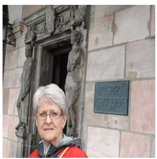
The "Justice" building in Nuremburg was the site of trials for war criminals.