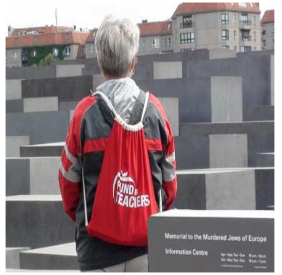
Jewish Memorial dedicated to those who died during Hitler's reign.