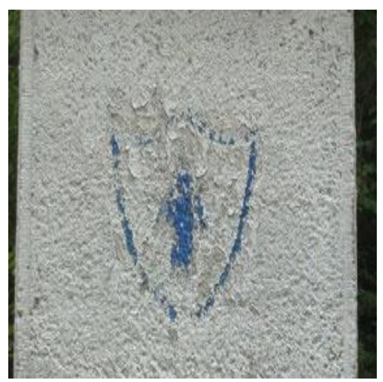
65 years of American presence in Germany is coming to a close.