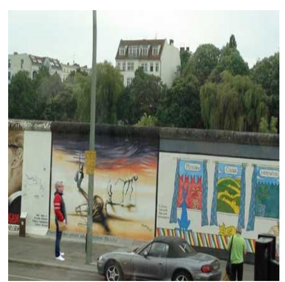
Remnants of the "Wall" still exit. The art depicts pain and suffering.