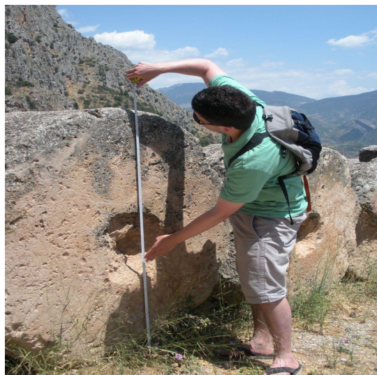
Measuring a Column Base in Delphi