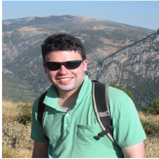
In the Hills Above Delphi