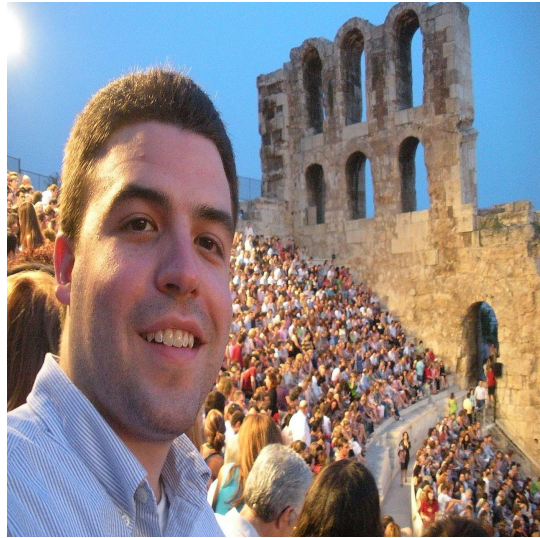
At a Performance at the Odeon of Herod Atticus