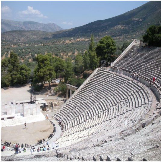
The Ancient Theater at Epidaurus