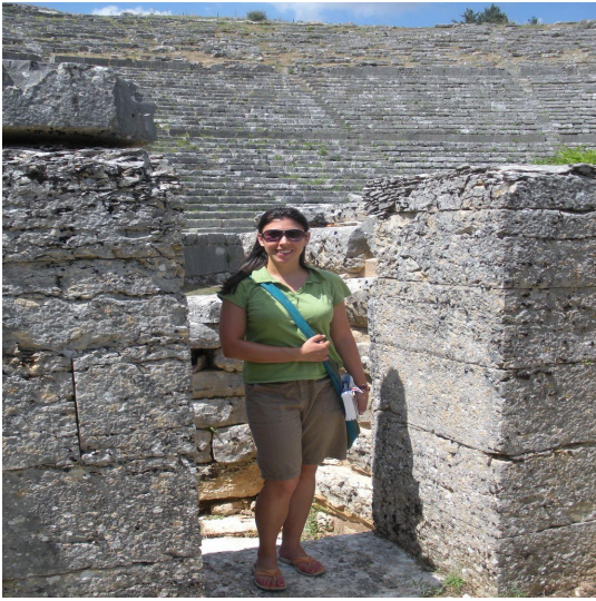
At the Theater of Dodoni