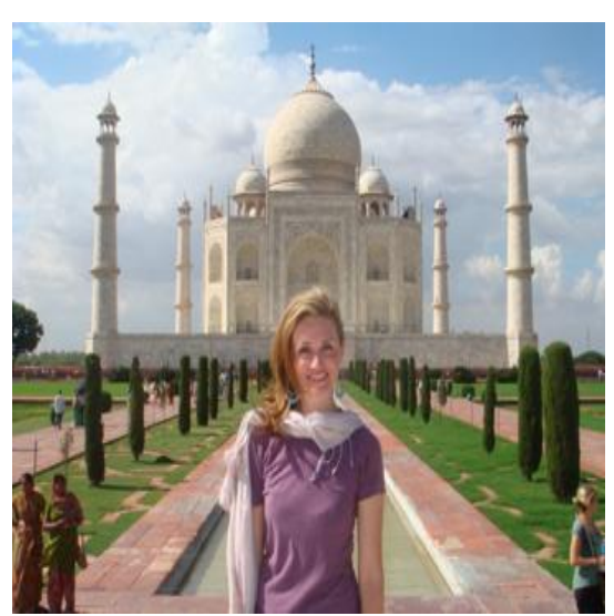
In front of an architectural wonder