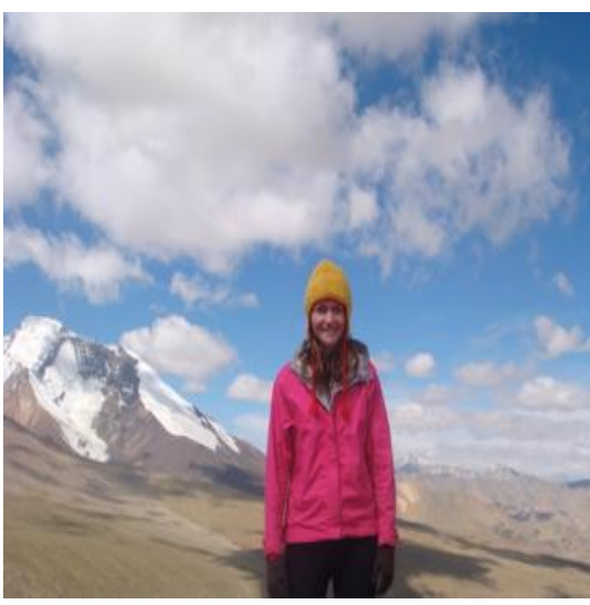
In the Himalayas