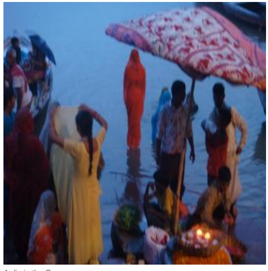
A dip in the Ganges