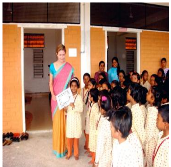
Presenting student of the week at school