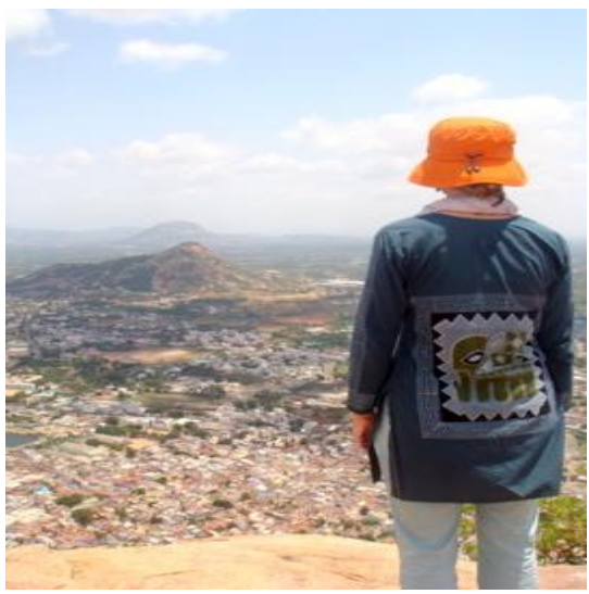
View from a temple over looking the southern plains