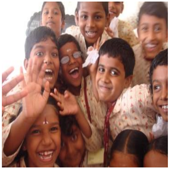
Students at school