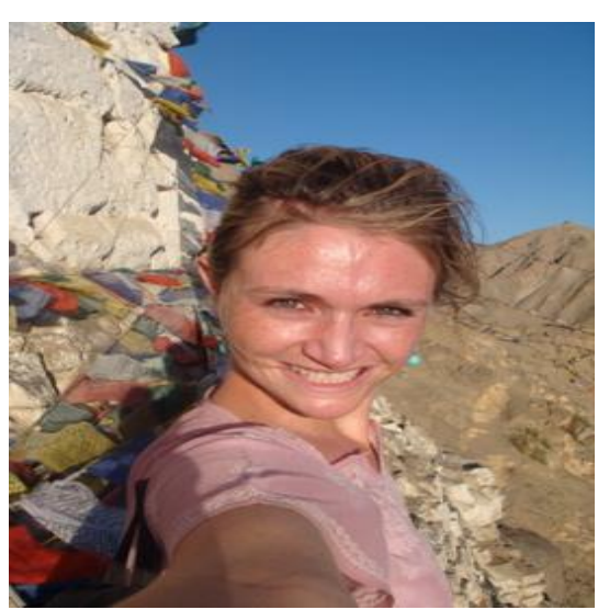
In a hillside monastery in Ladakh