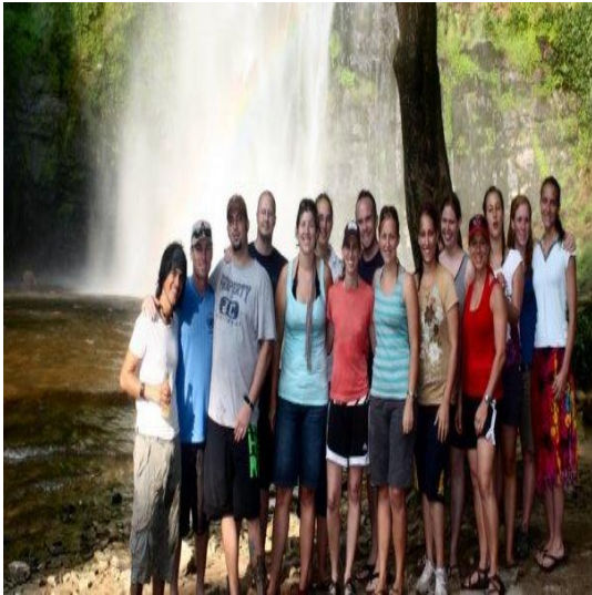
A group of us took a trip to nearby Ghana to explore and hike to waterfalls.