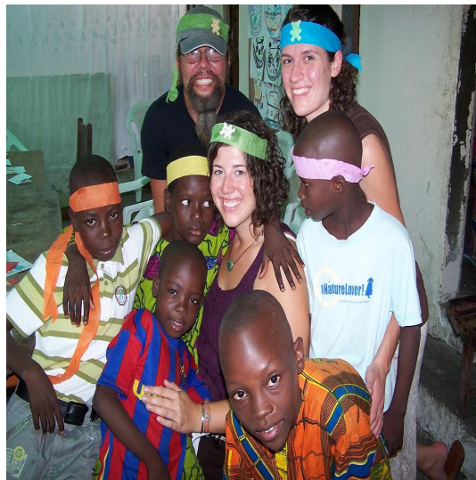
This orphanage had a school for the 35 children living there.