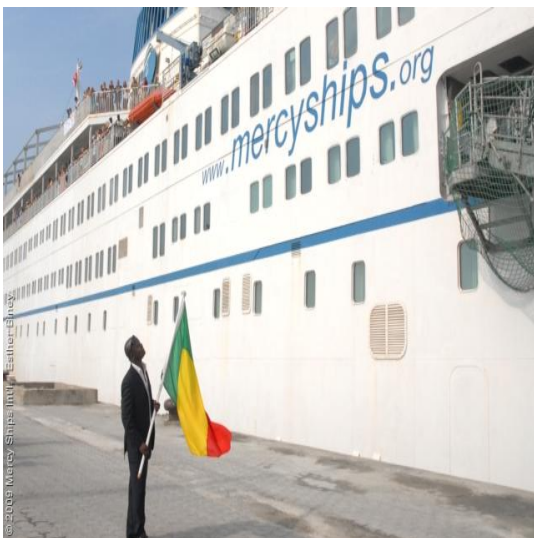
The ship being welcomed to port in Benin.