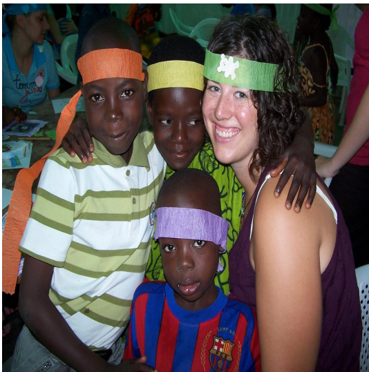
Working with kids at a local orphanage.