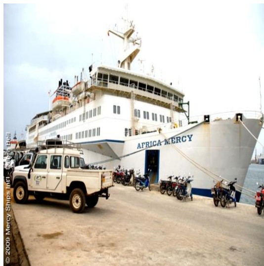
My home for six weeks.