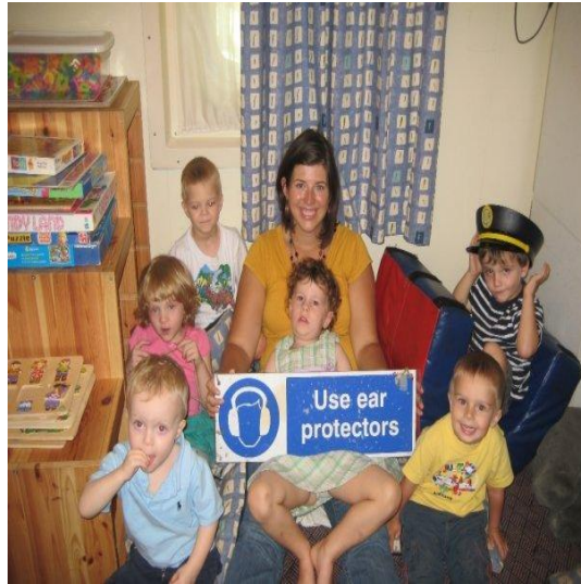
I spent my mornings with a loud group of international preschoolers.