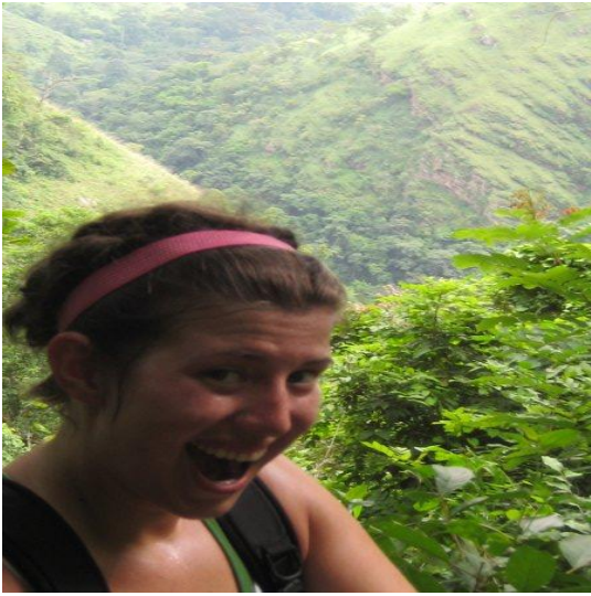
Me, very sweaty, hiking up to a beautiful waterfall in Ghana.