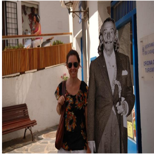
In Cadaques with Dalí