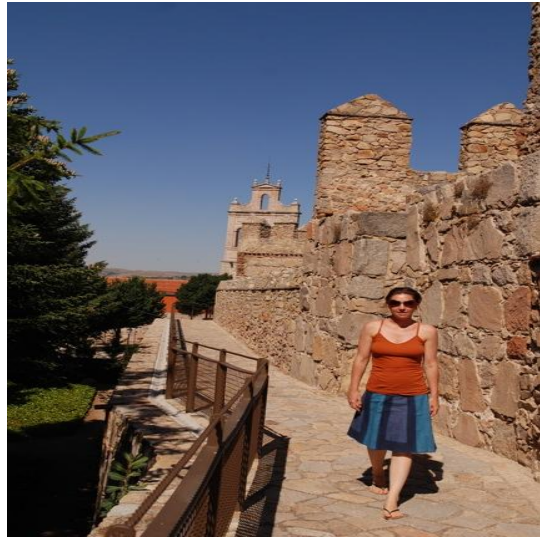
Walking the walls in Avila