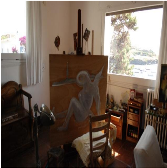
Salvador Dalí's studio