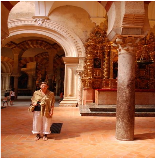
Islam and Christianity mesh architecturally in the Mosque in Cordoba