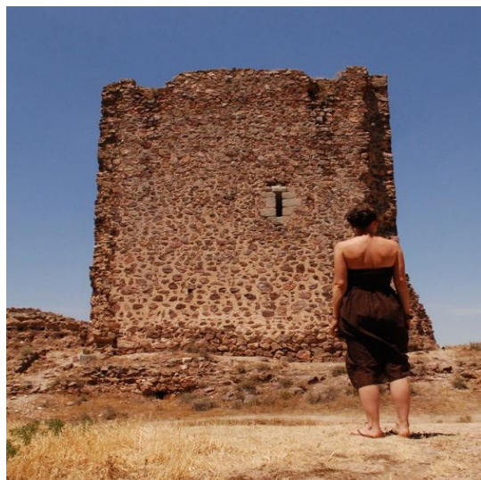
Exploring a ruined castle outside Salamanca