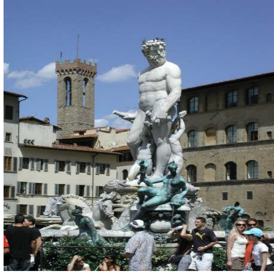
Piazza della Signoria, Neptune's fountain