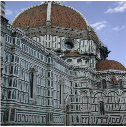
The Duomo, Santa Maria Del Fiore