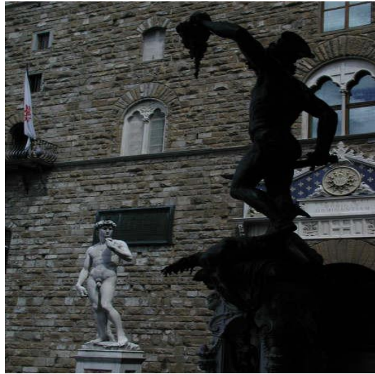
Michelangelo's David and Cellini's Perseus at Piazza della Signoria