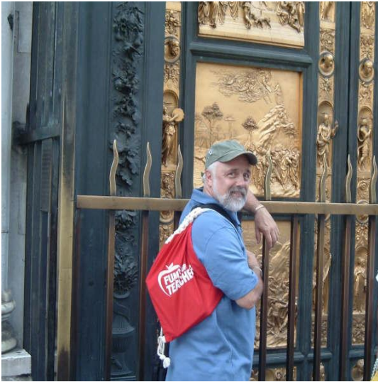
Ghibertio's doors of "Paradise"