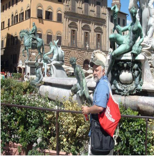
posing in front of the Neptune's fountain