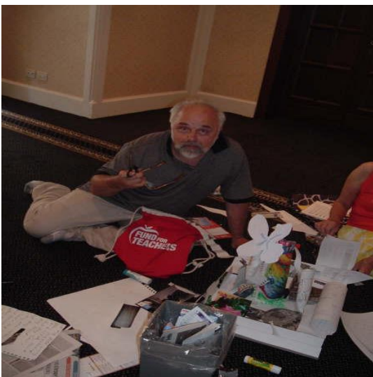
working on the Workshop floor