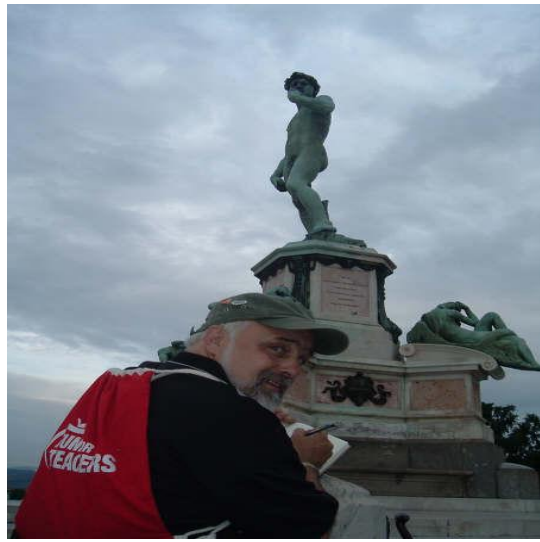
drawing David at the top of Piazza del Michelangelo