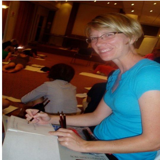
Working on illustrating a children's book