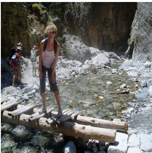
Crossing the river on the twelve mile hike through Samaria Gorge