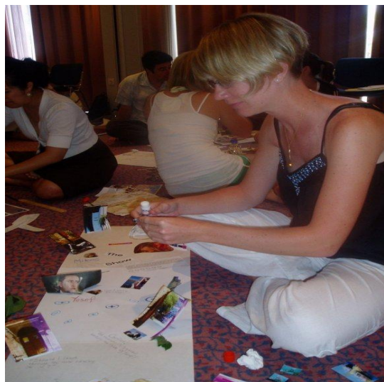
Creating a collaborative three dimensional photo story in the workshop