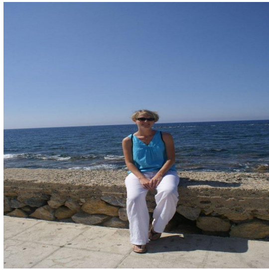
Relaxing at the port in the Old Town