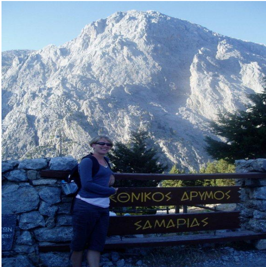
Hiking through Samaria Gorge, the longest gorge in Europe