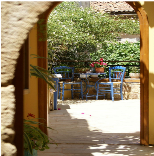
Doorway photo that I used to create a story as part of the workshop