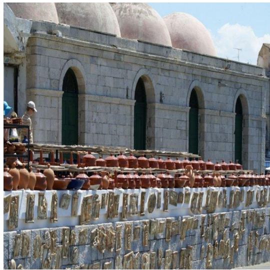
Taking a photo walking tour through Hania