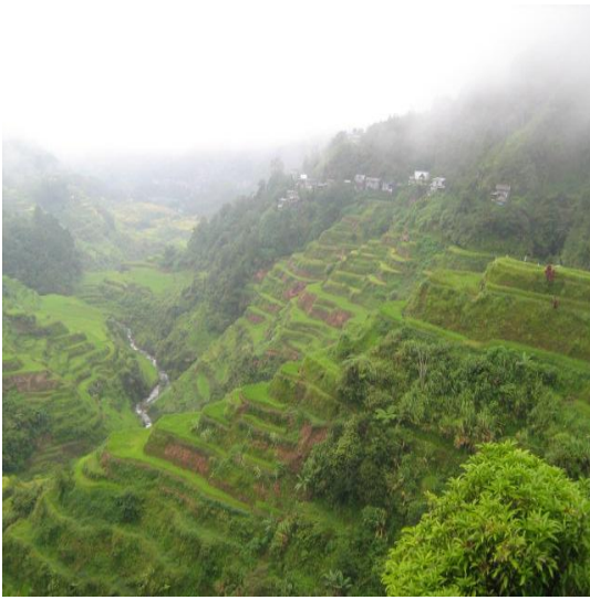
The mystic beauty of Banaue Rice Terraces