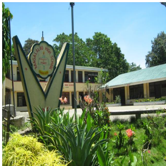
Magalalag High School, Tuguegarao City Campus