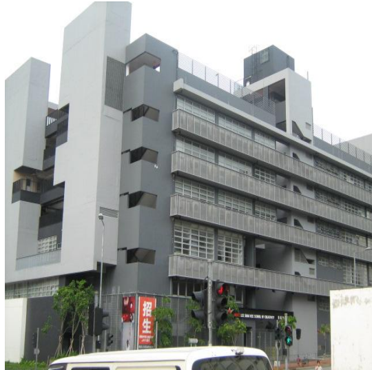
HKICC Lee Shau Kee School of Creativity Campus