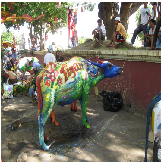
Carabao painting during Viva Vigan