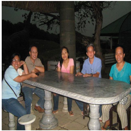
A pose with the Science specialists and teachers after the interview