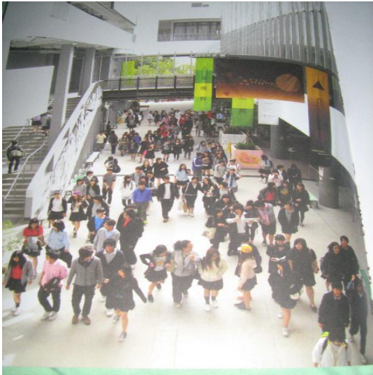
HKICC Lee Shau Kee School of Creativity students