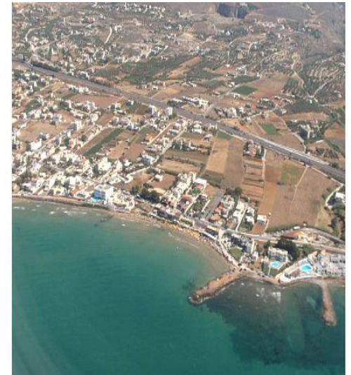
Greece Our Journey Begins