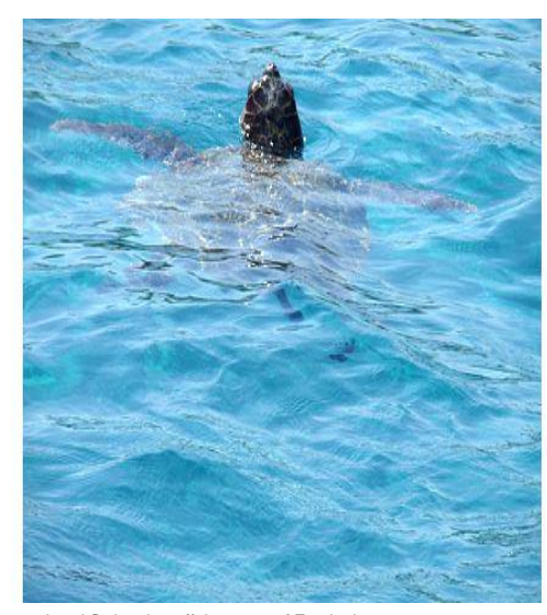
Loggerhead Swimming off the coast of Zanthythos