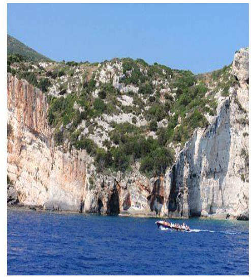
Islands scenery of Zanthythos