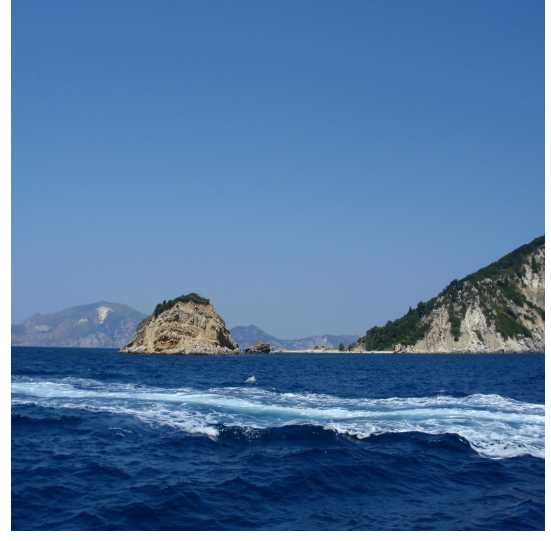
Waters of Loggerhead