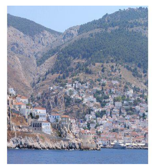
St marina Island