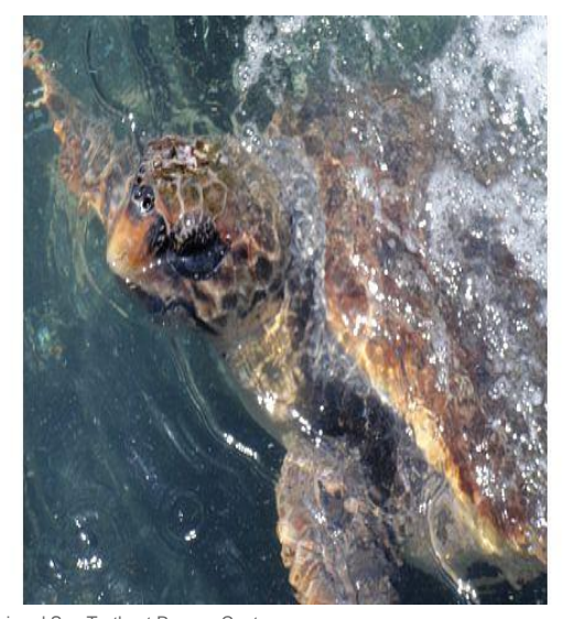
Injured Sea Turtle at Rescue Center