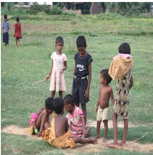
The children of the rural village