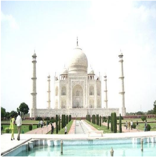
The Majestic Taj Mahal