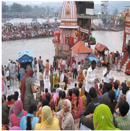
Crowds of People at a Religious Ceremony