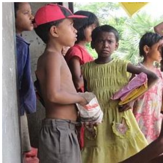
The children of a neighboring village