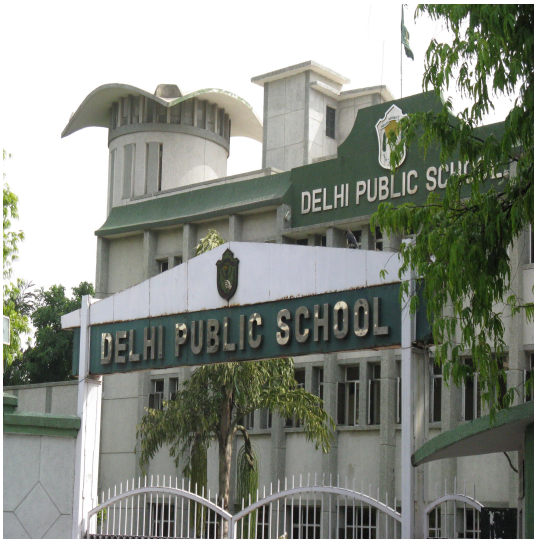
An Urban School in Delhi