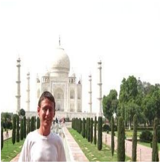
Me at the Taj Mahal