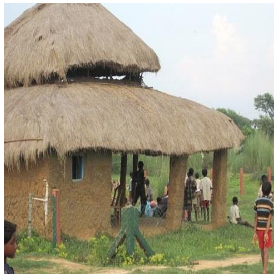
Teaching in the Rural Village