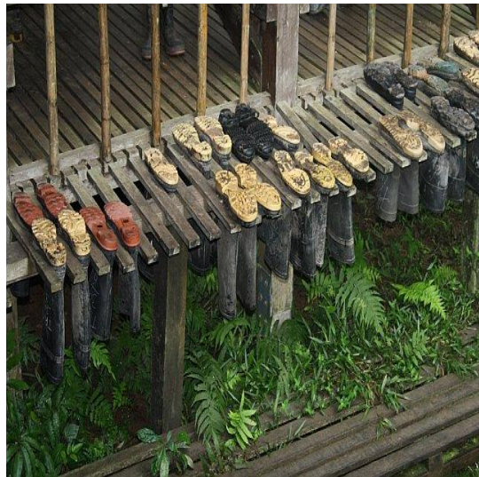
Boots + knee-deep mud = another day in the jungle.