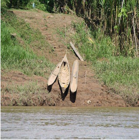
Rush hour on the river.