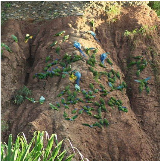
Macaws and parrots feeding at the clay lick.