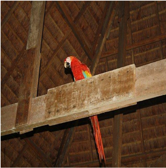
One of the Chicos returning to the TRC for a visit.