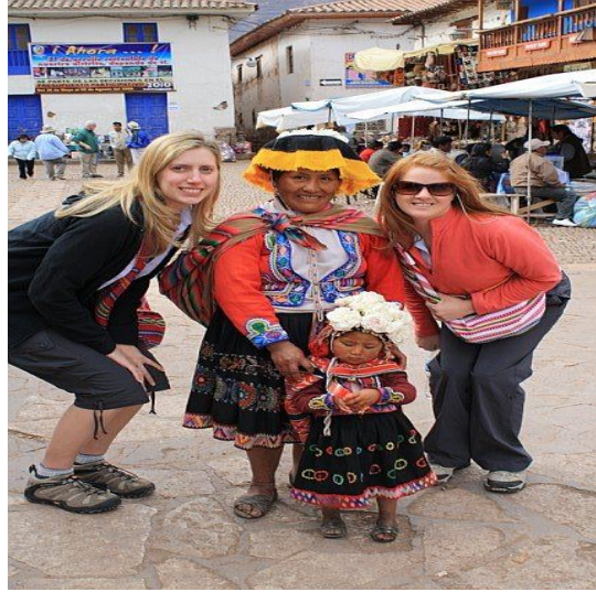
Hanging with the locals