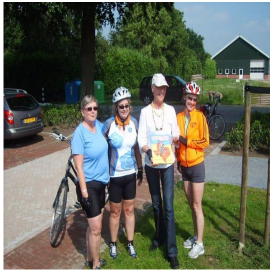
Visiting our colleagues on Holland's Teacher Appreciation Day