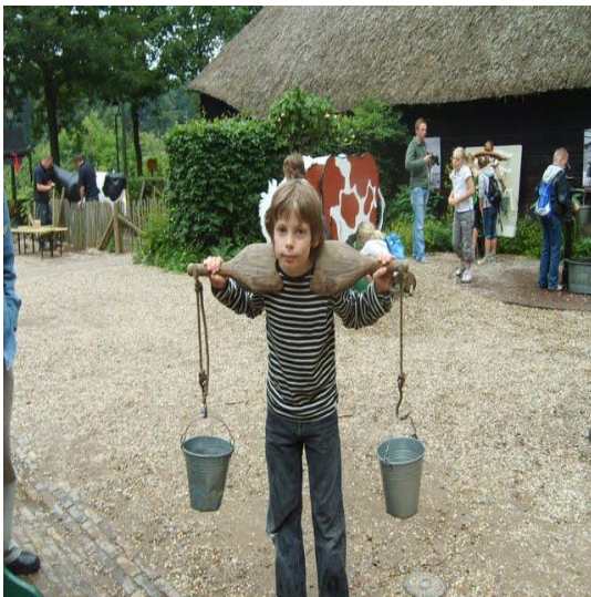
Dutch student on field trip at Open Air Museum