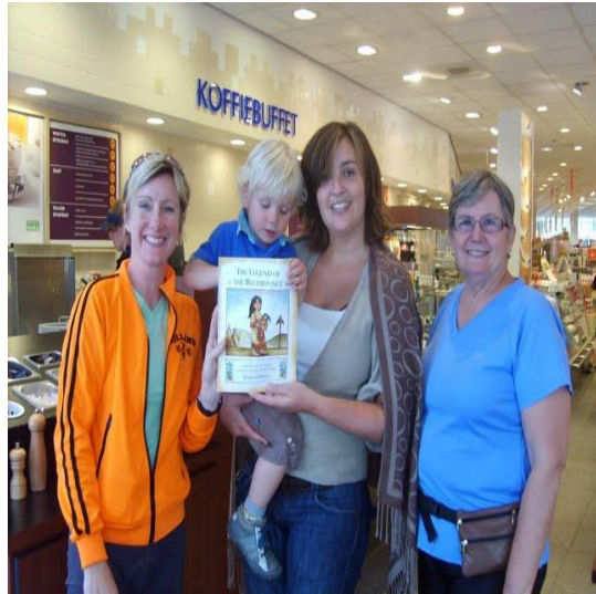
Giving a Texas souvenir to our new friend