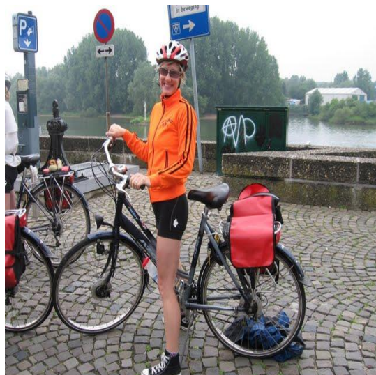
Preparing for a day of cycling on the dikes