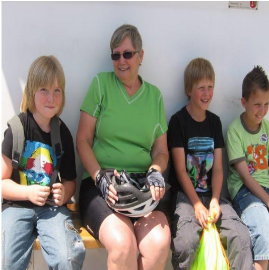
Dutch school children on a ferry to a castle