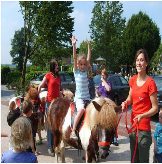
Dutch school girl on a Shetland pony at the park