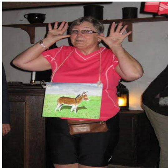
Punishment for bad behavior in a historic Dutch classroom