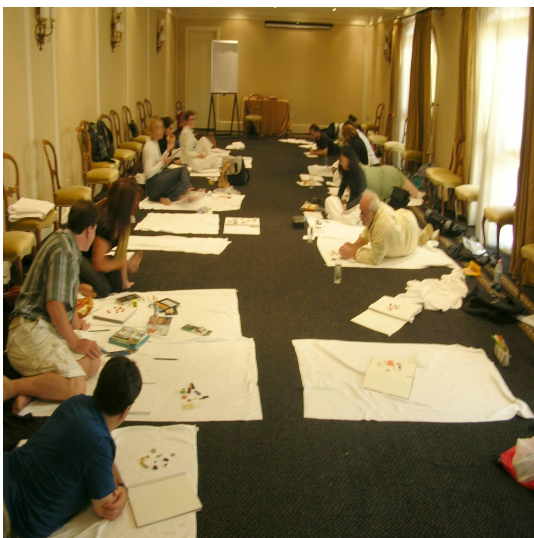
The Creativity Workshop in action! Shhhh! We're creating!!!