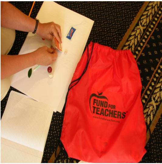
Tools of the Creativity Workshop - the hands of creativity!