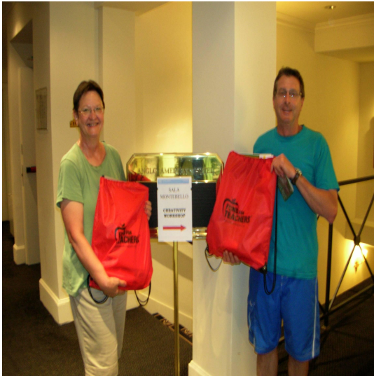
Our first day at the Creativity Workshop in Florence, Italy