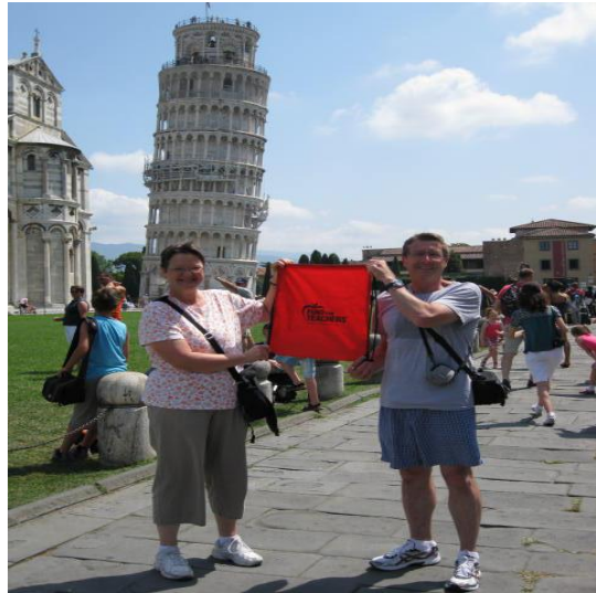
Day trip to Pisa to gather material for the workshop