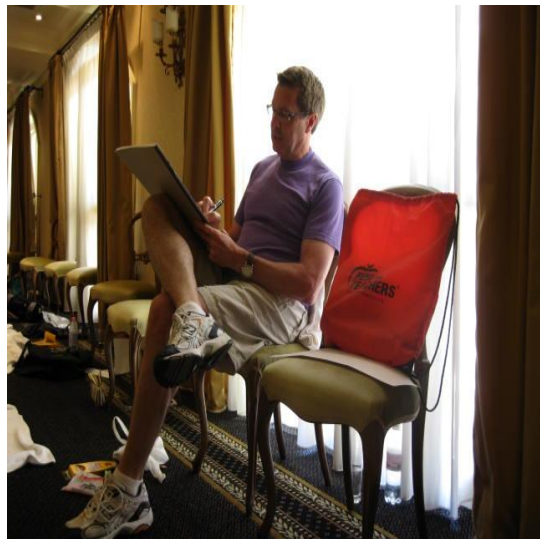
Flash fiction writing - very freeing and creative!