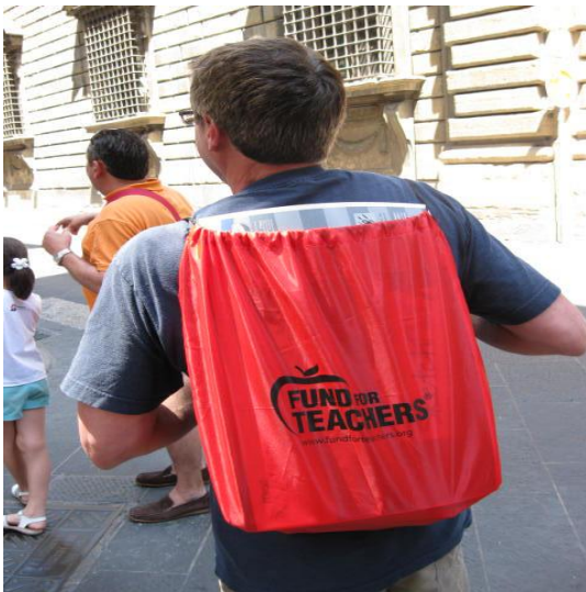
On our way to the workshop advertising Fund for Teachers!