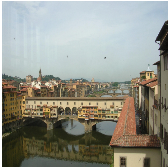
Florence, Italy - our creative inspiration!!