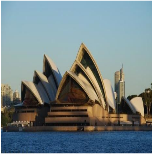
Sydney Opera House