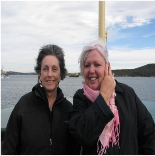
Ferry Ride, Sydney Harbor