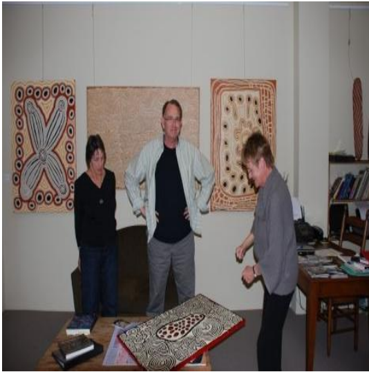
Art Gallery in Alice Springs, Northern Territory, Australia