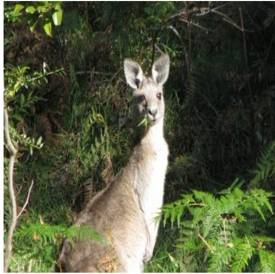
Wallaby near Jamberoo, NSW