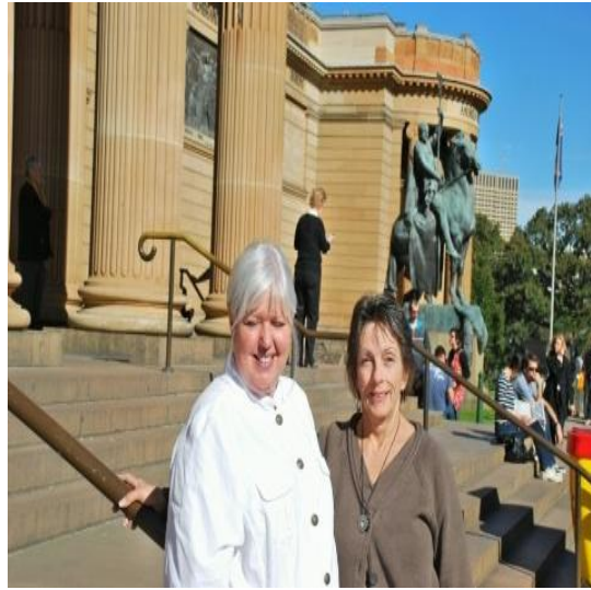
National Gallery of Art, New South Wales