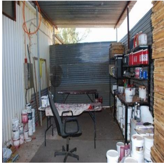
Artist Shed, Alice Springs