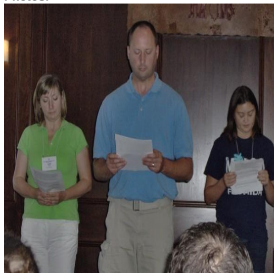
A Spirit Read from the Grave of Sacco and Vanzetti