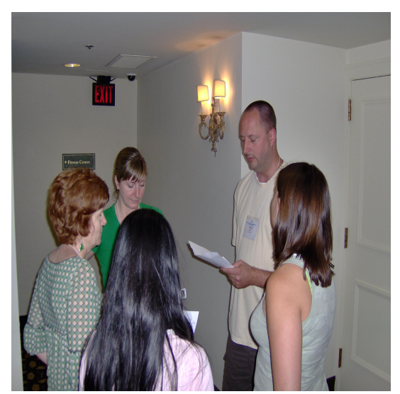
At Work in Crew