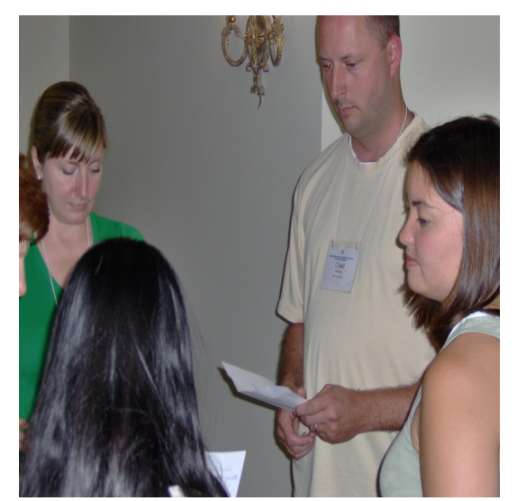
Working in Crew