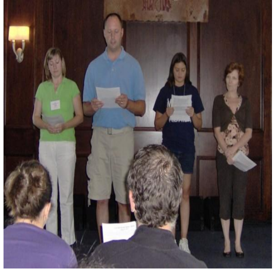
A Spirit Read from the Grave of Sacco and Vanzetti