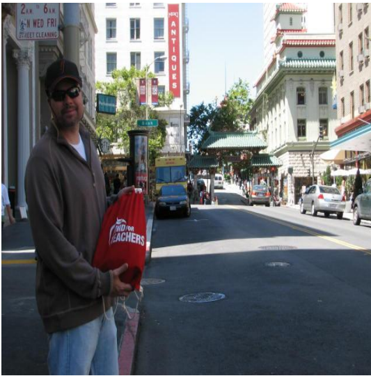
Like My Bag?