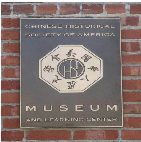
Chinese Historical Society of America