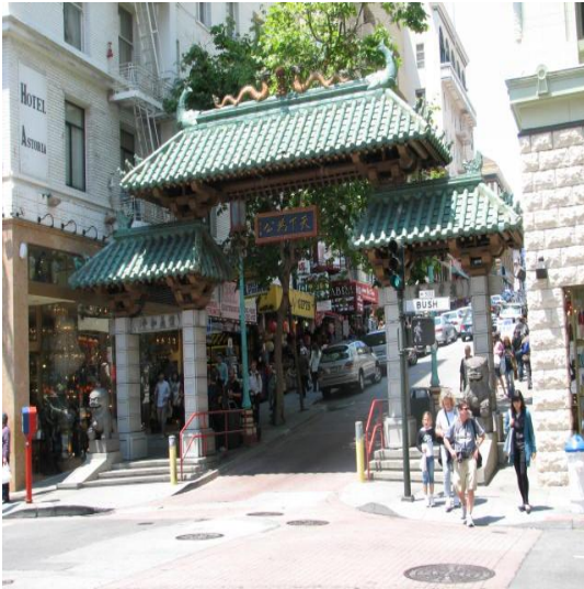
The Famous Chinatown Gate