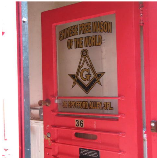
Sun Yat-Sen's Former Residence