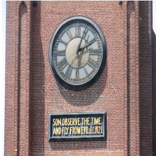
St. Mary's Church Clocktower with Some Advice