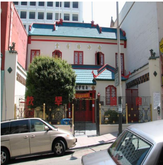
Nam Kue Chinese School