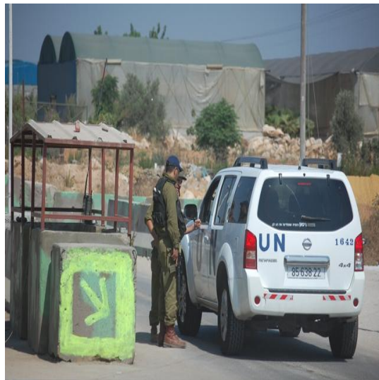
Checkpoints and Closures