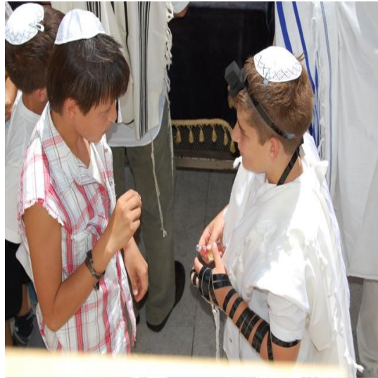
Bar Mitzvah at the Western Wall