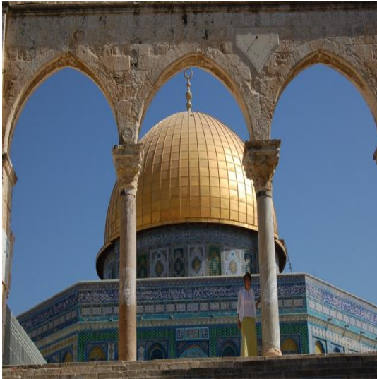
Dome of the Rock