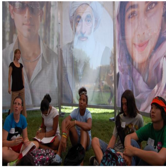
Student Fieldwork Fall 2008