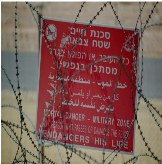
Mortal Danger -- The realities of separation