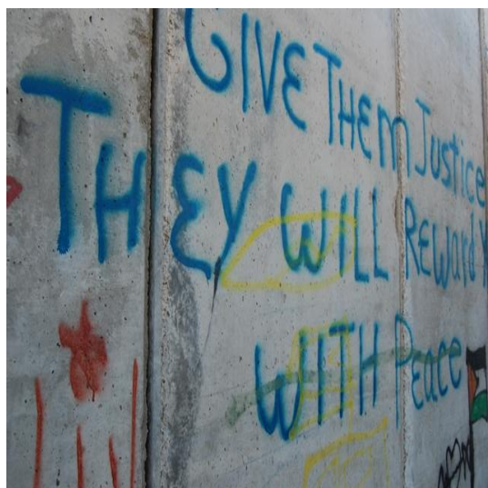
Hope for Progress