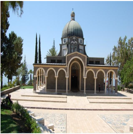
Church of the Beatitudes