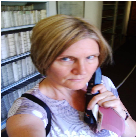
Touring the Monastic Library of Strahov