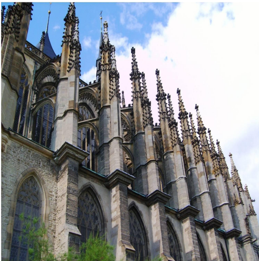
Santa Barbara Cathedral, Kutna Hora