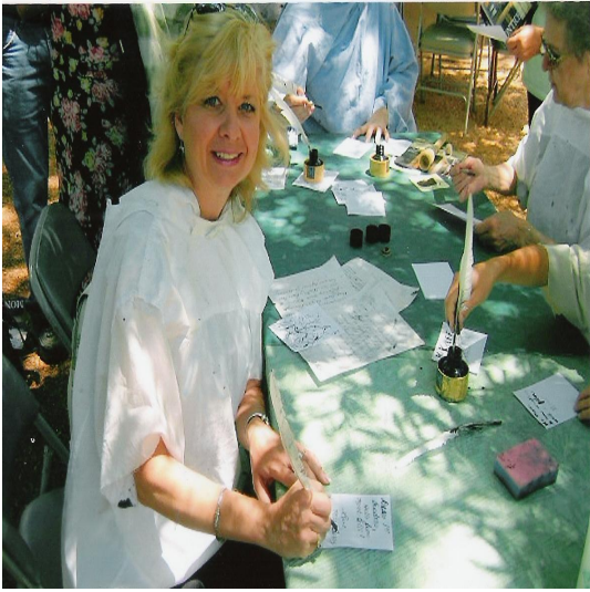
Quill and Ink