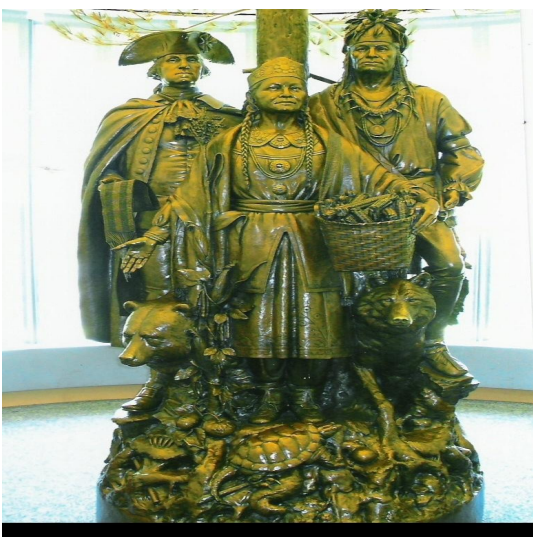
Allies in War/ Partners in Peace