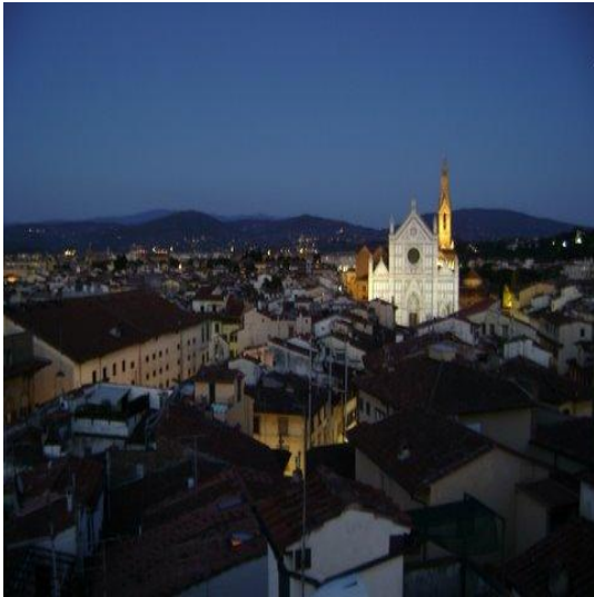
A night view of Santa Croce