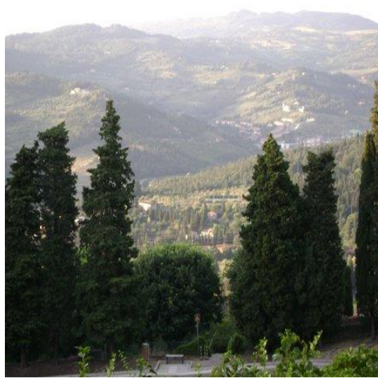
A view of Florence from Fiesole