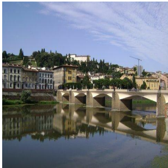
Ponte Vecchio across the Arno River