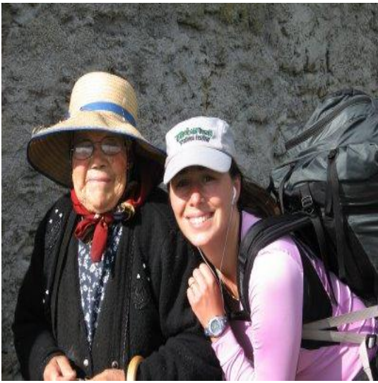
Friends on the camino