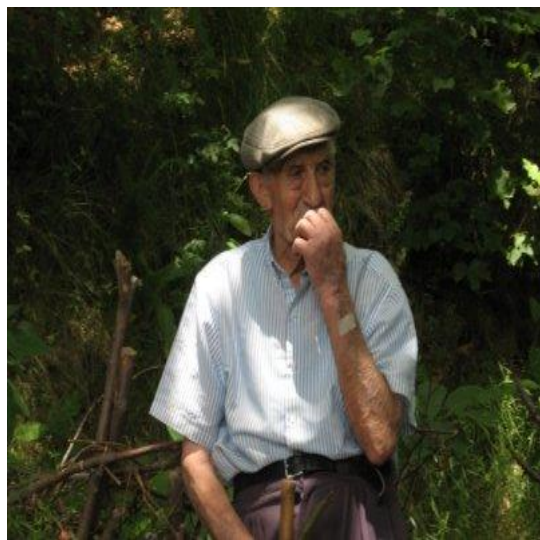
Reflections on the camino