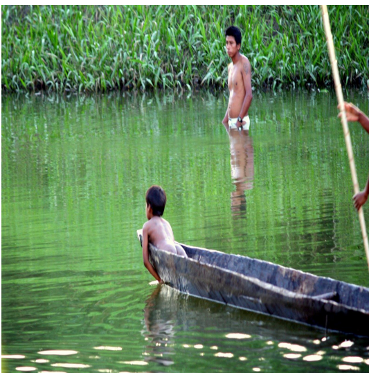
Fishing in the Amazon