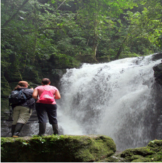
Waterfalls in the Amazon Rainforest