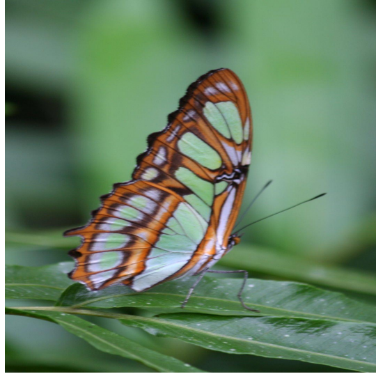
Butterflies fluttering by