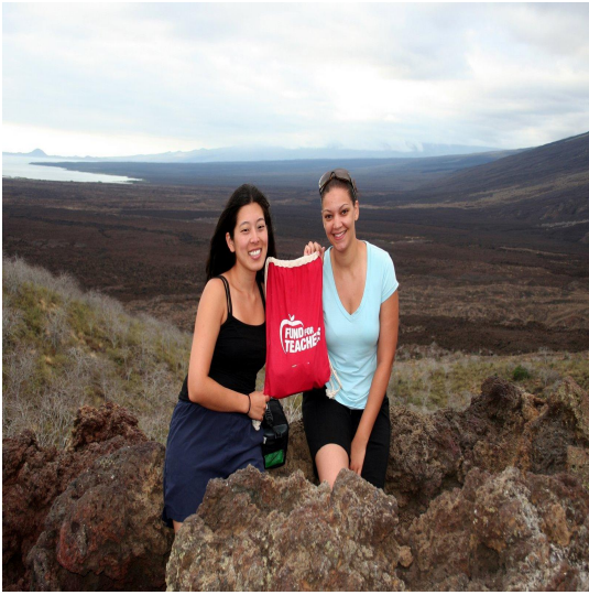
Beautiful view in the Galapagos Islands