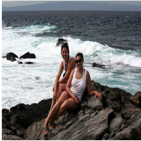
More beautiful views in the Galapagos Islands