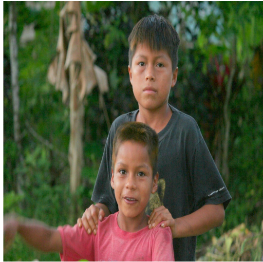
The people of the Amazon