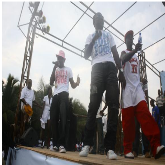
Critically Acclaimed Hip Life Group Praye' performs to promote Presidential candidate