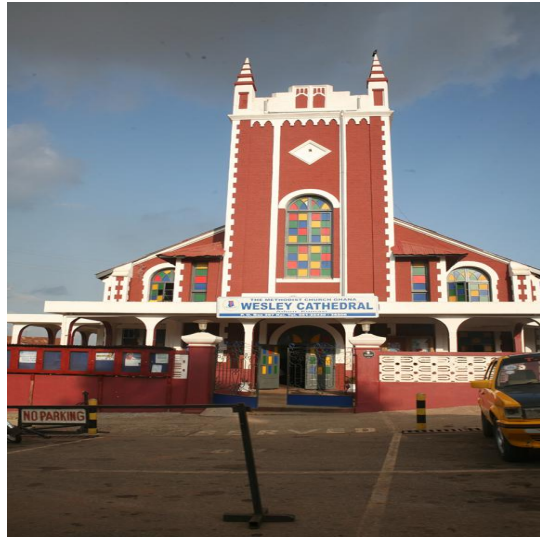
Cathedral Kumasi, Ghana