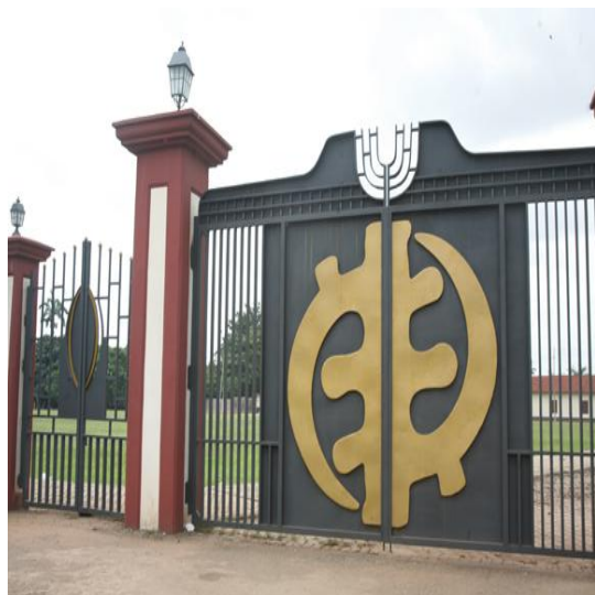
Manhyia Palace Museum