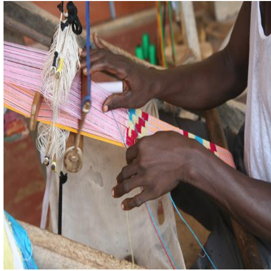
Weaving Kente Cloth in Bonwire