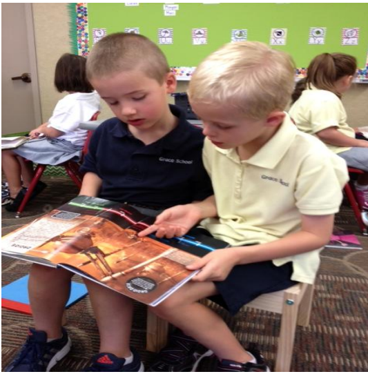
Students practicing with their partners during Reader's Workshop.