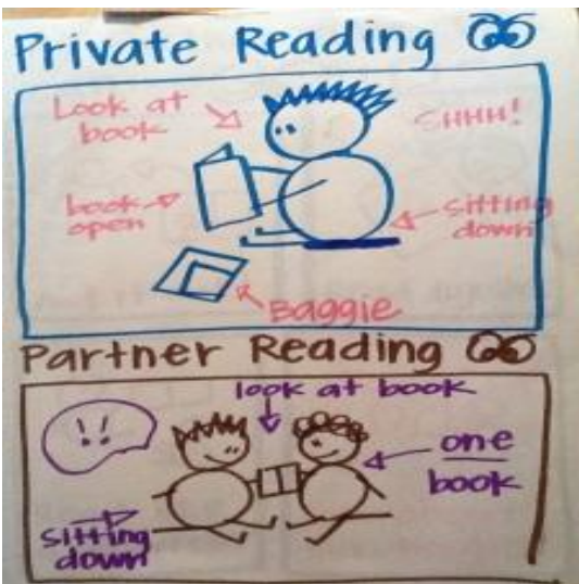
This is an example of an anchor chart shared during one of our sessions.