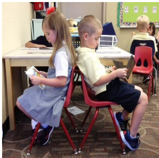
Students engage in private reading during Reader's Workshop.