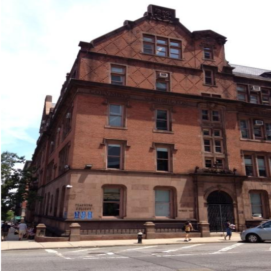
Teachers College at Columbia University. This was our classroom for the week!