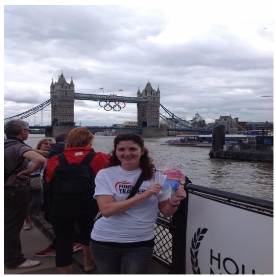
Flat Stanley and I checking out the Olympic Rings at Tower Bridge