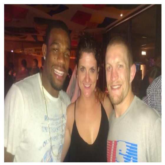
Gold Medalist Jordan Burroughs at the USA wrestling celebration