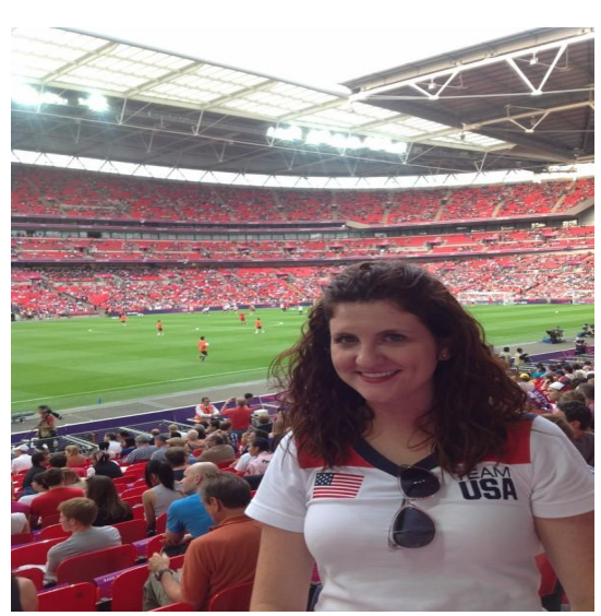
USA vs. Japan in the Gold Medal game at Wembley. Final score, U.S.-2 Japan-1