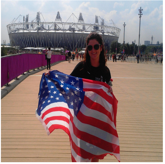
Go USA! Standing in front of the Olympic Stadium in London.