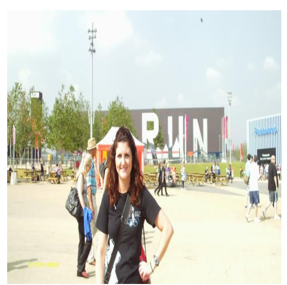
Seeing the sights at Olympic Park