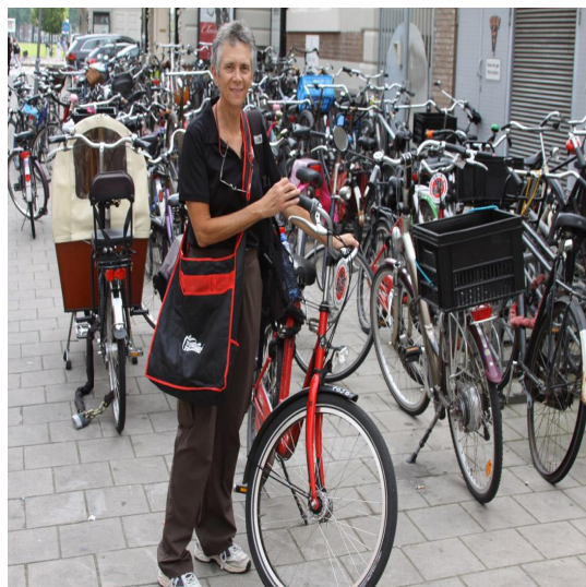
Amsterdam- Travel like the locals.