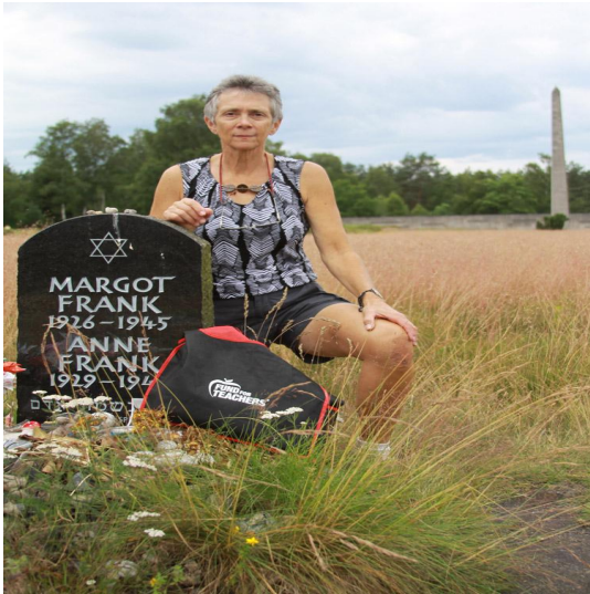
Fulfilling a life's quest for understanding at Bergen-Belsen Concentration Camp