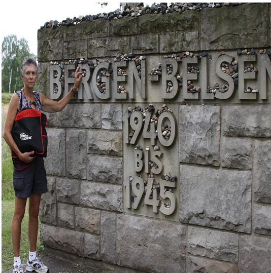
Following Jewish tradition: leaving a stone for the dead, Bergen-Belsen