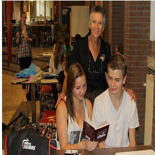
Discussing The Diary of Anne Frank, Hilversum International Campus.