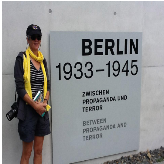
Berlin: Study at the "Between Propaganda and Terror" Installation