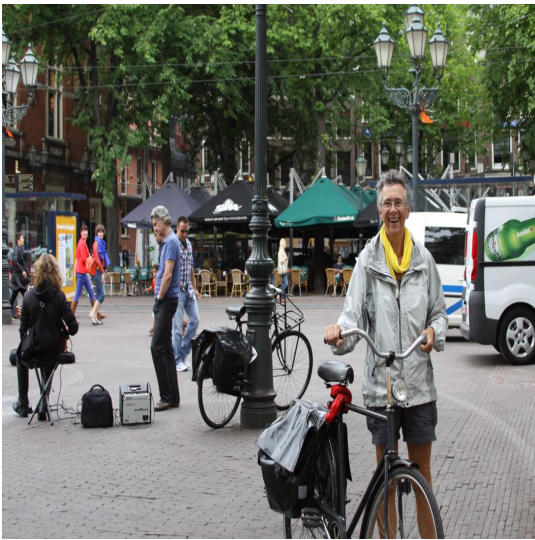
Travel to the Secret Annex, Amsterdam.