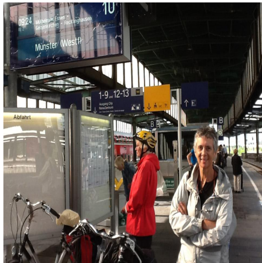
If it rains, hop a train with the bike to next town!,-Muenster, Germany