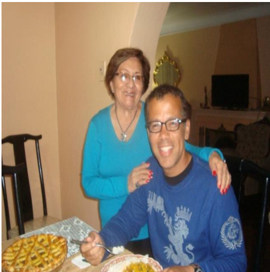
Preparing to eat a traditional meal with my Peruvian family!