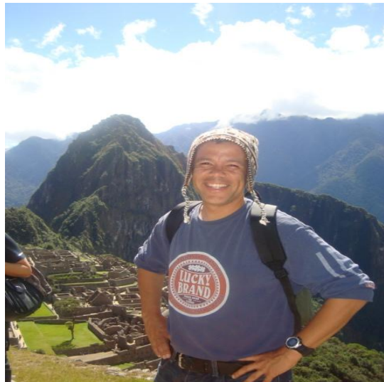
Standing atop Machu Picchu after visiting the museum.