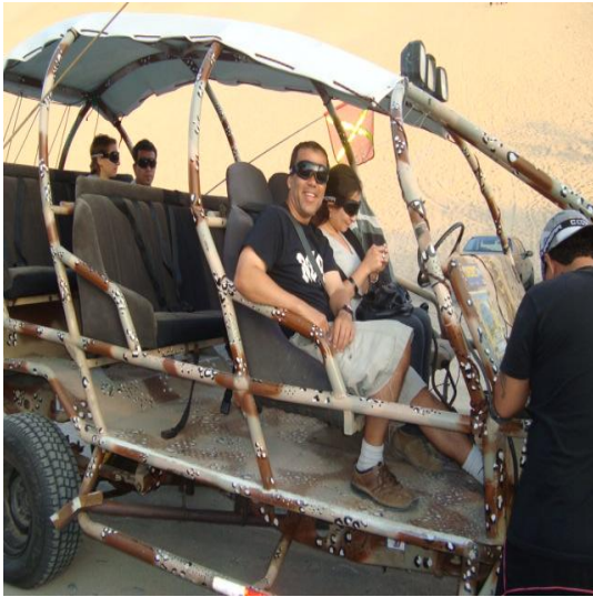
Exploring a desert environment in Peru.