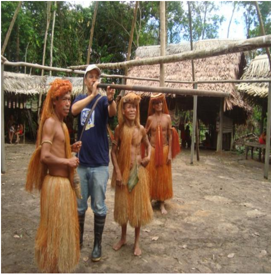
Yagua natives in the Amazon rainforest demonstrate blowpipe techniques.