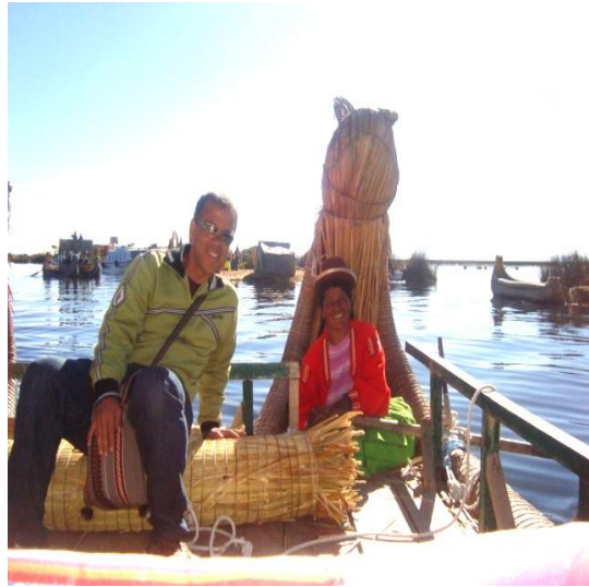
Sailing on Lake Titicaca with an inhabitant of the "Floating Islands."