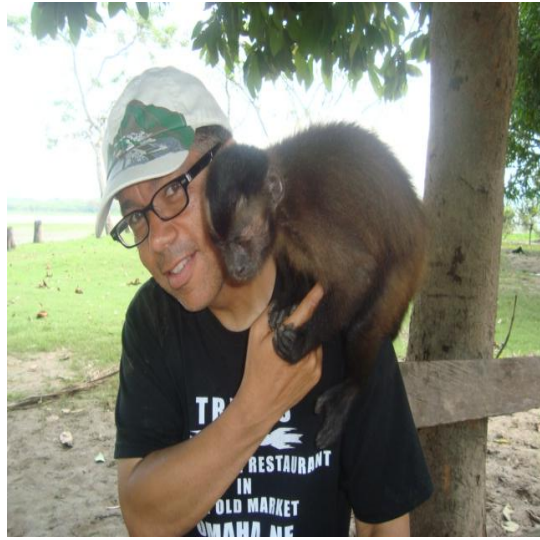
This monkey demonstrates his prowess in the Amazon Rainforest.