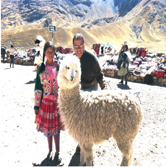
Llama encounter on the way to Lake Titicaca.