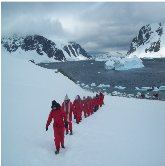
Hiking to the top of Cuverville Island