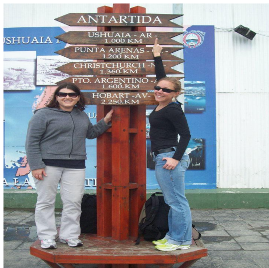
El Fin del Mundo, the end of the world in Ushuaia, Argentina