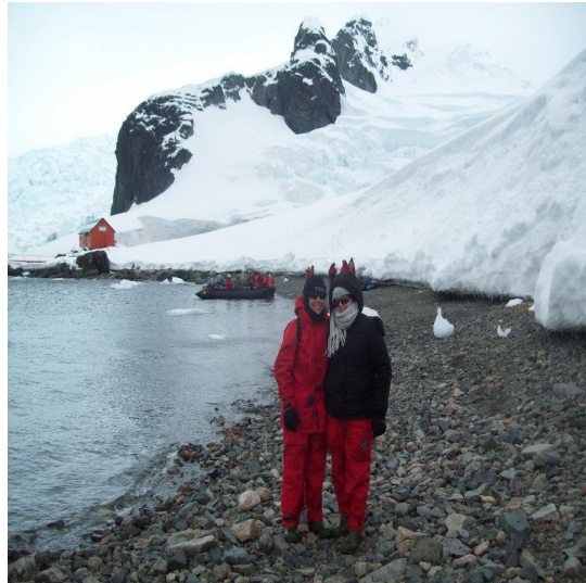
Landing on the Antarctic Continent at Neko Harbor