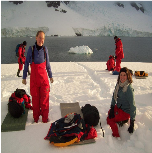
Camping at Leith Cove in Paradise Harbor