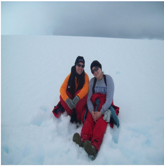
Taking a break from hiking on Danco Island, Antarctica