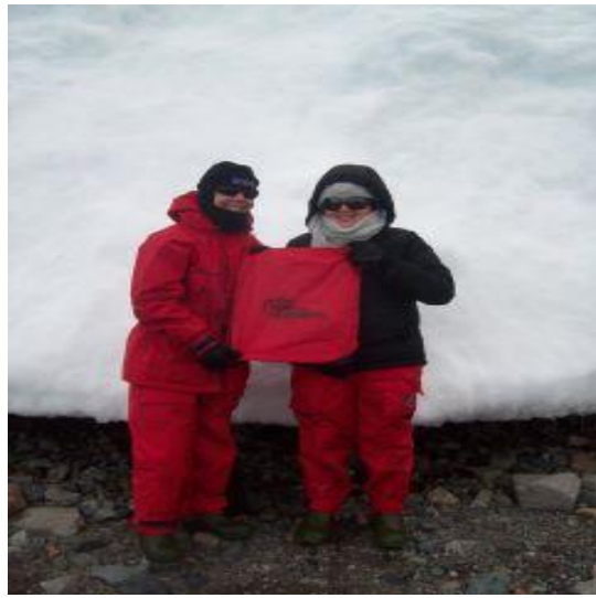
Thank you Fund for Teachers! Orne Harbor, Antarctica