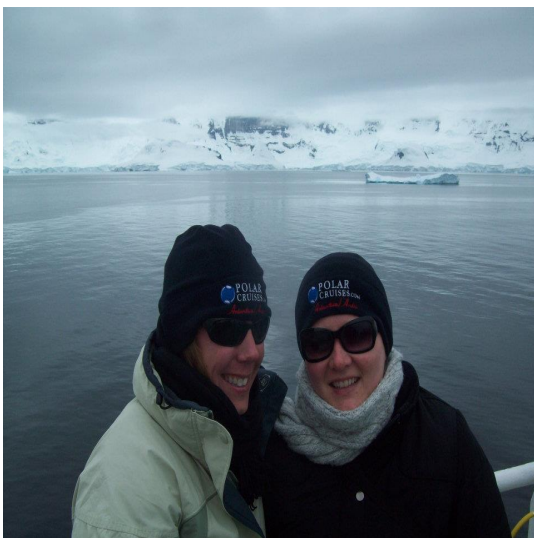
A view of sea, ice, and snowy mountains from the ship