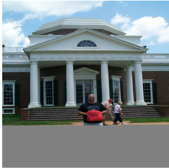
In front of Monticello