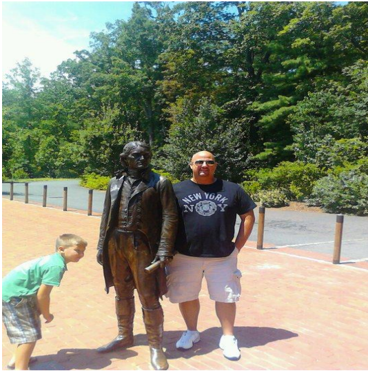
With statue of Jefferson at Monticello