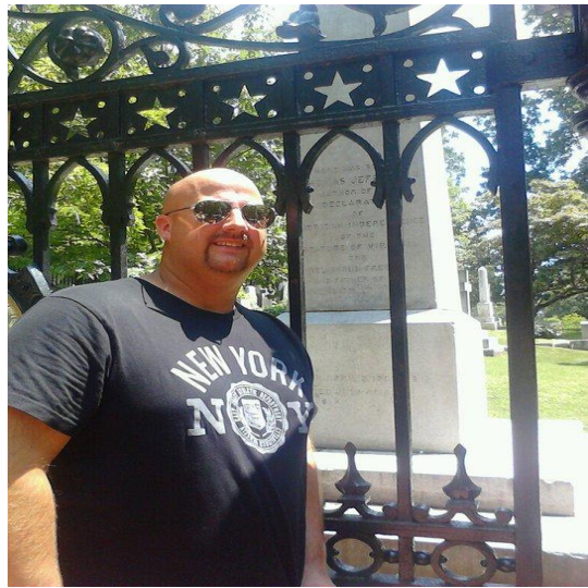
At Monticello - Jefferson's tomb