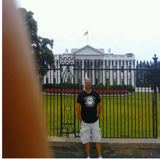
At the White House - just finished touring the White House