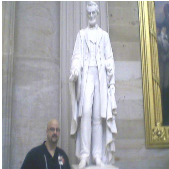
Statuary Hall in the US Capitol with President Lincoln