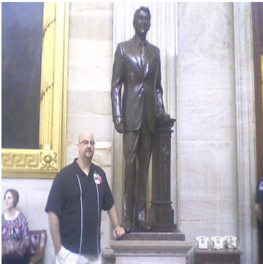
Statuary Hall in the US Captiol with President Reagan