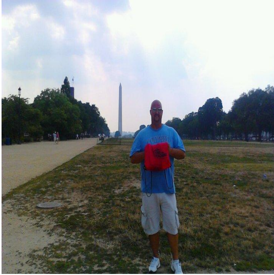
On the National Mall with Washington Monument in background