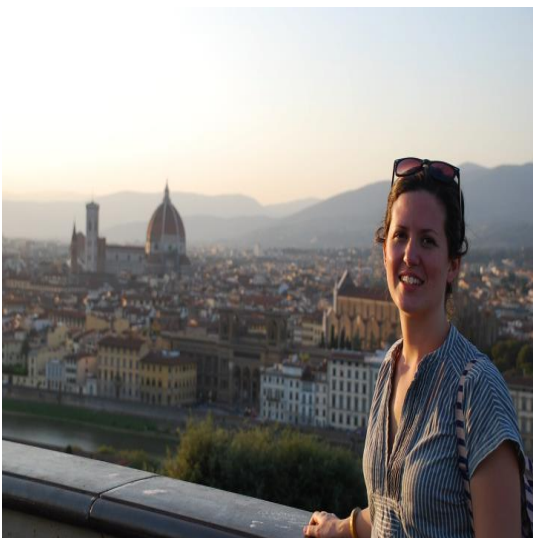
A picturesque view of the city of Florence.