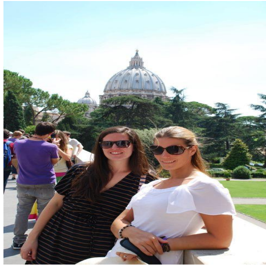
Michelangelo's dome of St. Peter's was a landmark from anywhere in the city.