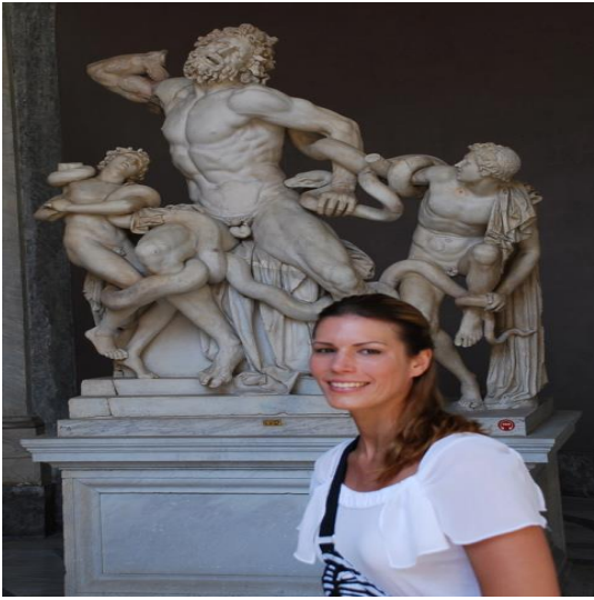
The Laocoön Group provided inspiration for Renaissance artists.