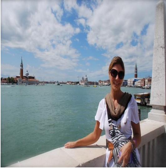
It was easy to understand why the city of Venice inspired so many artists.