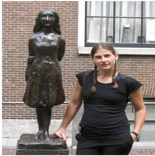
Anne Frank Statue at the West Church