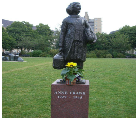
Anne Frank Statue at Merwedeplein