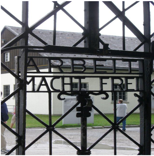
Arbeit Macht Frei