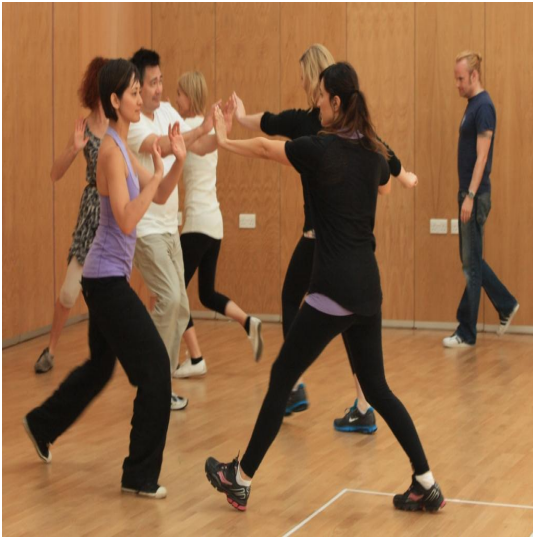
Stage combat class