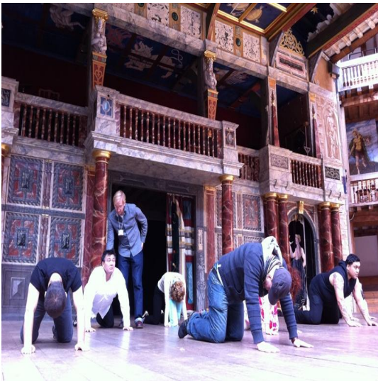
Close-up of stage