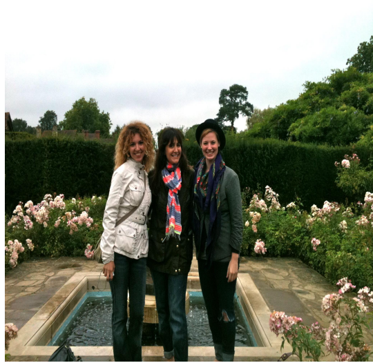
With actresses from America and Italy at Hever Castle, home of Anne Boleyn