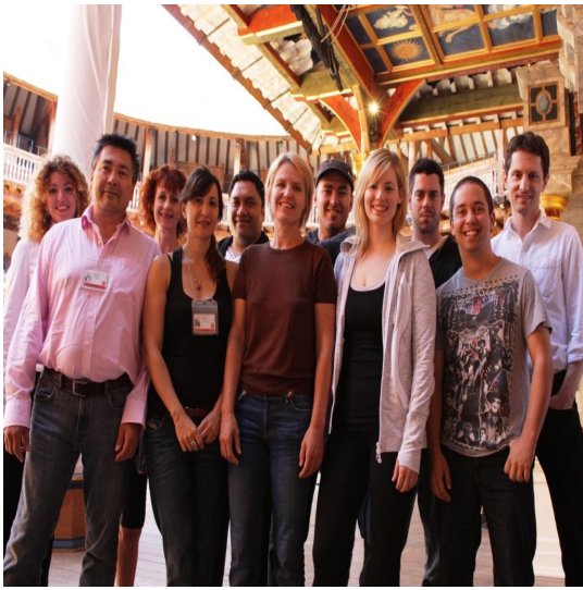
Group photo with a good view of "The Heavens" above