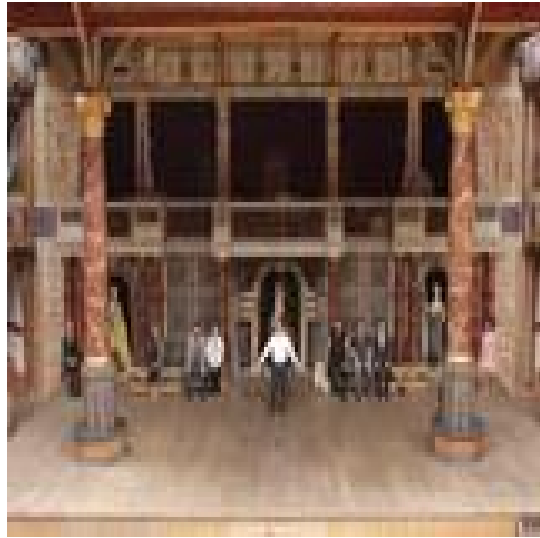
View of the Globe stage from the audience