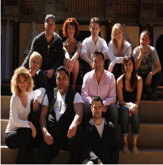
On the Globe Stage with the International Fellowship Actors