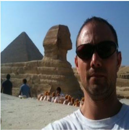
At the Sphinx and Pyramids