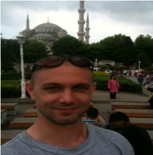
At the Blue Mosque in Istanbul Turkey