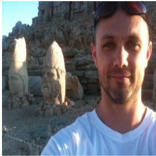
At the top of a Turkish Mountain Nemrut with ancient Greek statues