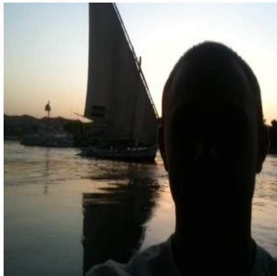
On a faluca sailing up the Nile River