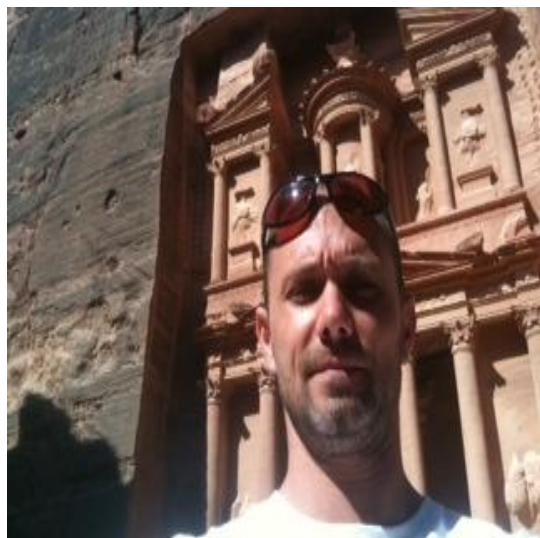
At Petra in Jordan