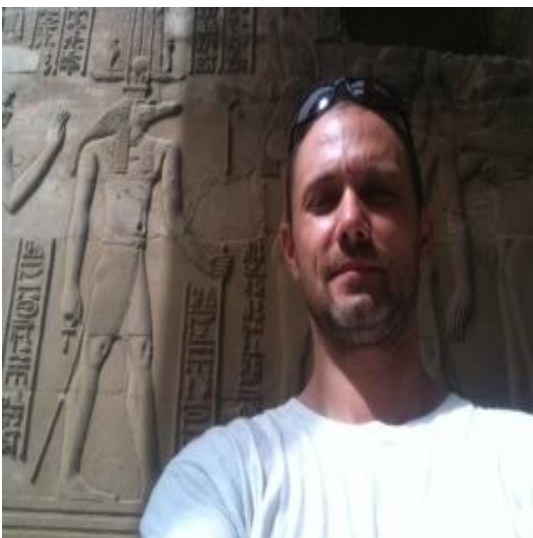
At an ancient Egyptian temple