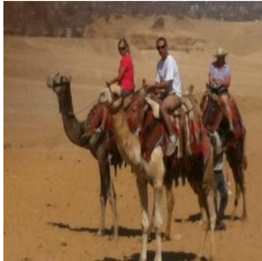
Riding a Camel at the Pyramids in Egypt