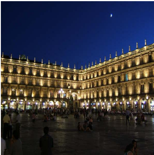
Salamanca's Plaza Mayor