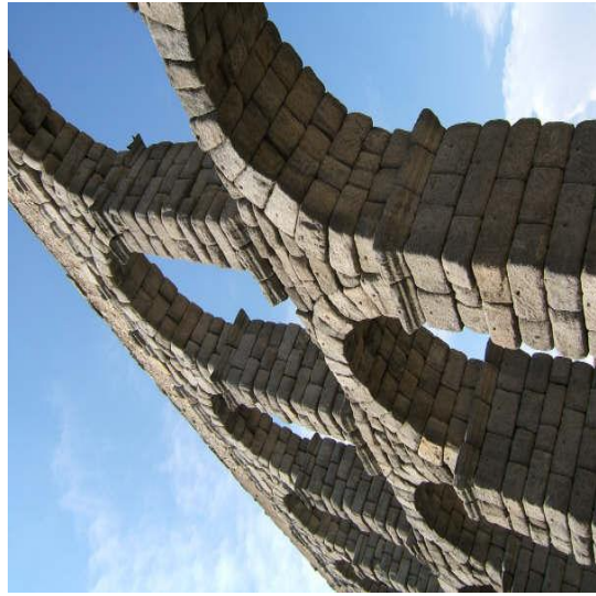
Roman Aqueducts of Segovia