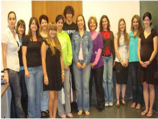
Spanish Language Class