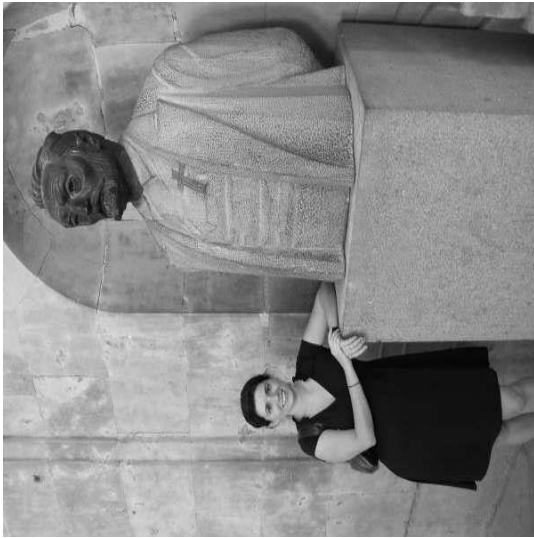
Miguel de Unamuno and me