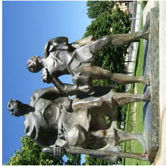
Lazarillo de Tormes Statue