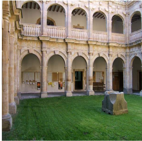
University of Salamanca Language Building